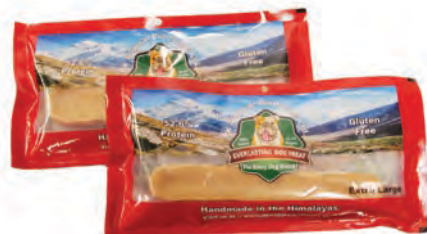
PK Naturals Everlasting Yak Milk Chew Extra Large