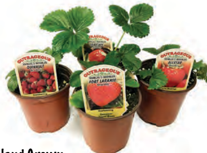
Island Grown Strawberry Plants All Varieties 739ML