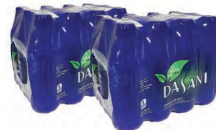
Dasani Water 12 Pack