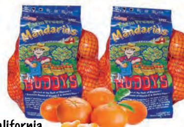
California Mandarins 2LB 907G You Save $3 00 EA