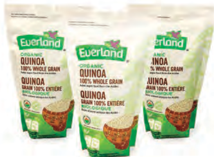
Everland Organic Quinoa 681G