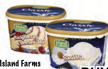
Island Farms Classic & Vanilla Plus Ice Cream All Varieties, 1.65L You Save $7 99 EA