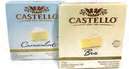
Castello Brie & Camembert 125G