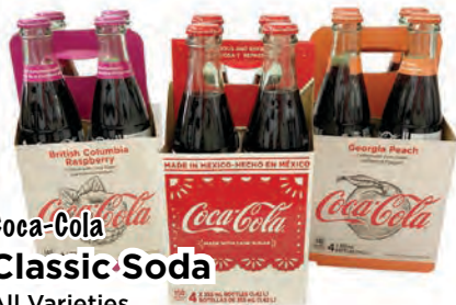
Coca-Cola Classic Soda All Varieties SINGLE 355ML