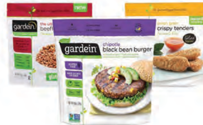
Gardein Meatless Meats All Varieties 255-390G