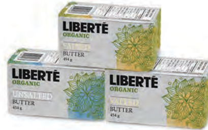
Liberte Organic Butter Regular or Unsalted 454G