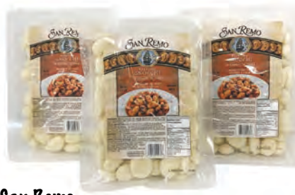
San Remo Gnocchi Select Varieties 500G