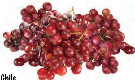
Chile Red Grapes $4.39/KG You Save $2 LB/ $6 61 KG