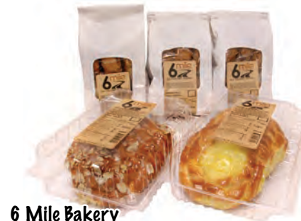
6 Mile Bakery Donuts, Danish or Butterhorn All Varieties - 4-6 Pack