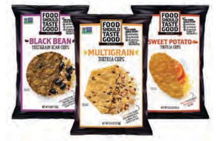
Food Should Taste Good Chips All Varieties 156G