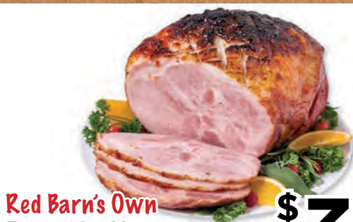
Red Barn's Own Bone-In Hams $7.91/KG