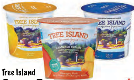
Tree Island Cream Top Yogurt All Varieties 500G