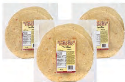
Indian Life Tortillas All Varieties 500G