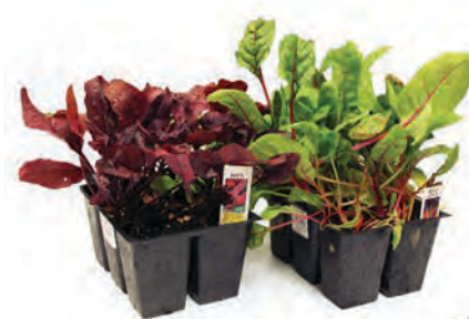
Veggie Starters Select Varieties 6 Pack