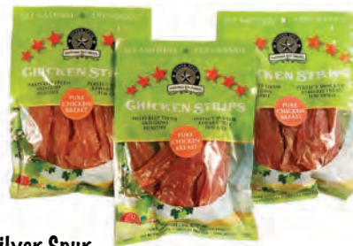
Silver Spur Chicken Strips Jerky All Varieties 200G