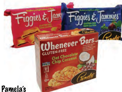
Pamela's Fig Bars & Whenever Bars 398ML