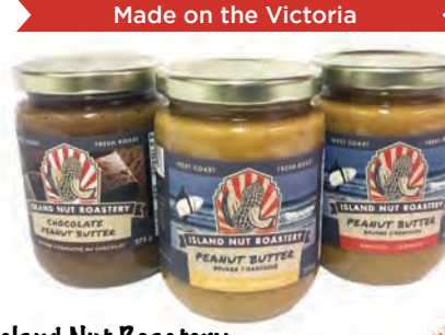
Island Nut Roastery Peanut Butter Crunchy, Smooth or Chocolate - 375G