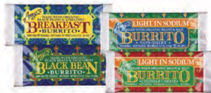
Amy's Burritos All Varieties 156G