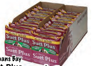
St Albans Bay Suet Plus Peanut Blend 12 Pack

Top Shelf Feeds is proud to be Island Owned & Operated and has been serving the Island's commercial and hobby farmers with quality products for over 44 years.