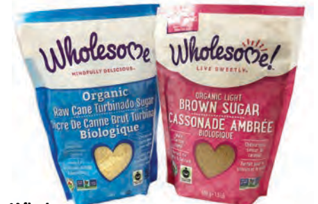
Wholesome Organic Cane Sugar 680G