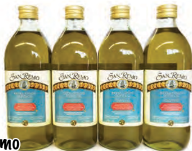
San Remo Extra Virgin Olive Oil 1L