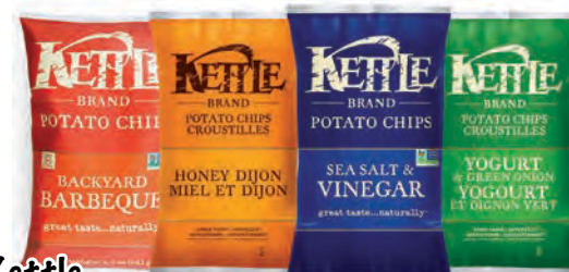
Kettle Chips All Varieties, 170-220G You Save $1 44 EA