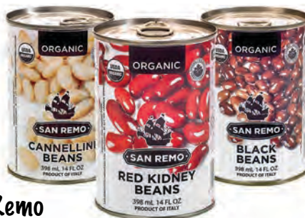
San Remo Organic Beans All Varieties 398ML