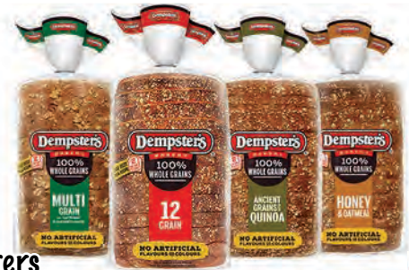
Dempsters Whole Grain Bread All Varieties 600G