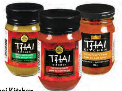
Thai Kitchen Curry Paste All Varieties 112G