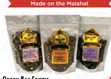
Queen Bee Farms Loose Tea All Varieties 75G