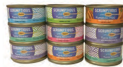
Scrumptious Cat Food All Varieties 2.8OZ