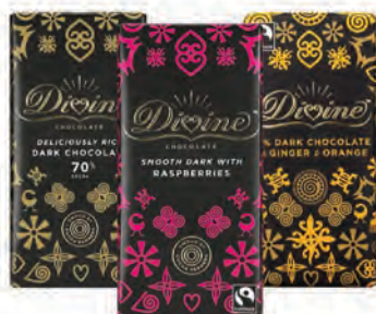
Divine Chocolate Bars All Varieties 100G