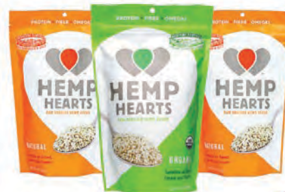
Manitoba Harvest Hemp Hearts All Varieties 220-227G