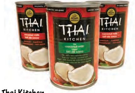
Thai Kitchen Coconut Milk All Varieties 400ML