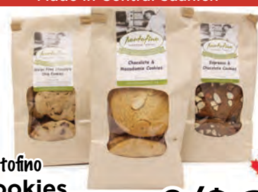
Portofino Cookies All Varieties, 8 Pack You Save $2 00 EA