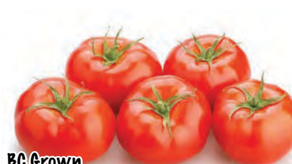
BC Grown Beefsteak Tomatoes $2.18/KG You Save $1 00 LB/ $2 21 KG