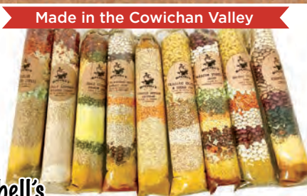
Mitchell's Soups All Varieties You Save $4 00 EA