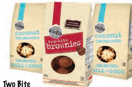
Two Bite Brownies & Macaroons 280G