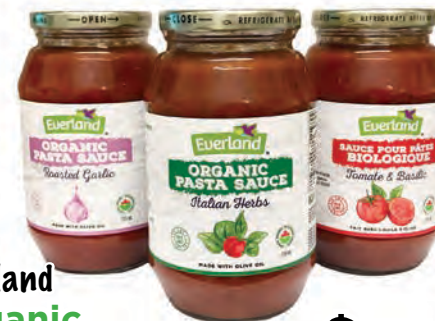
Everland Organic Pasta Sauce 739ML, All Varieties