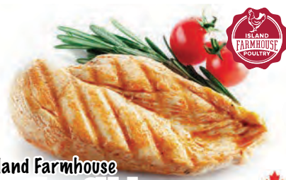
Island Farmhouse Boneless Skinless Chicken Breasts $11.00/KG You Save $4 50 LB/ $9 92 KG