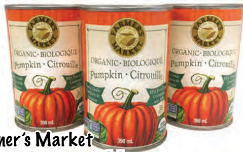
Farmer's Market Organic Pumpkin Puree 397G