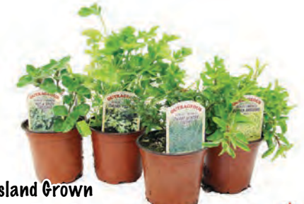
Island Grown Herbs & Perennials Select Varieties 4"