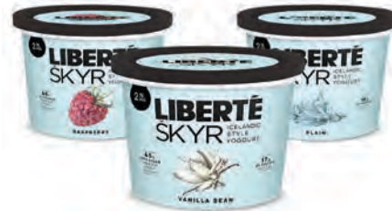
Liberte Skyr Yogurt All Varieties 500G