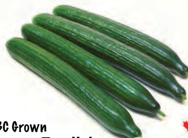
BC Grown Long English Cucumber You Save $1 00 EA