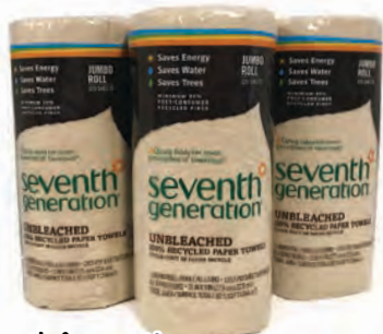
Seventh Generation Paper Towel All Varieties 120 Sheet