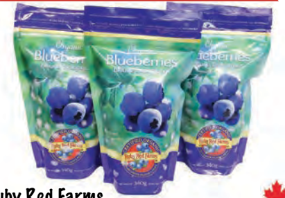
Ruby Red Farms Organic Blueberries 340G