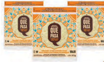
Que Pasa Stone Ground Corn Tortillas 312G