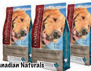
Canadian Naturals Dog Food Chicken & Brown Rice Extra Large

Available at All Locations Except Vanalman