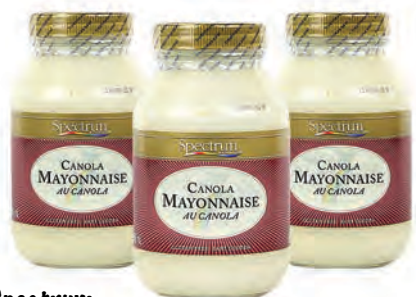
Spectrum Canola Mayo All Varieties 946ML