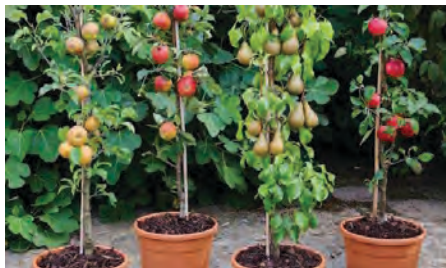
Fruit Trees Apple, Cherry, Peach, Pear, Plum 5 Gallon