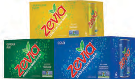
Zevia Soda All Varieties 6 Pack