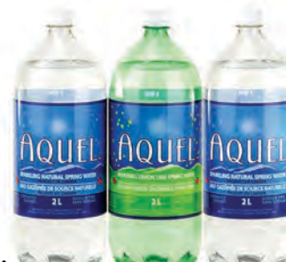
Aquel Sparkling Water All Varieties 2L