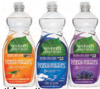
Seventh Generation Liquid Dish Soap All Varieties 739ML