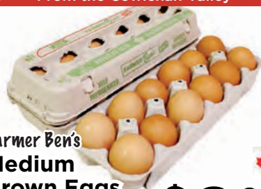
Farmer Ben's Medium Brown Eggs Dozen You Save $1 00 EA