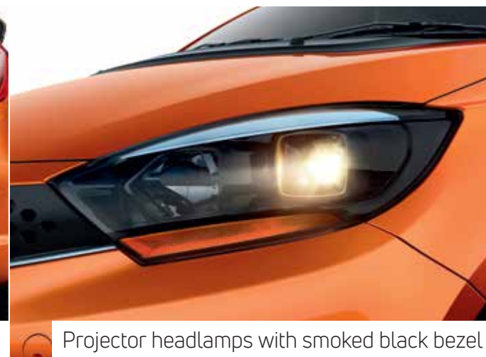
Projector headlamps with smoked black bezel