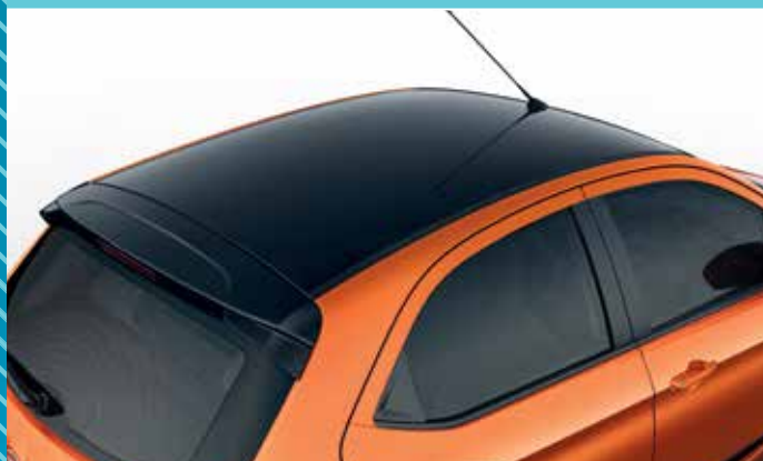
Dual tone exterior option with glossy black roof & spoiler