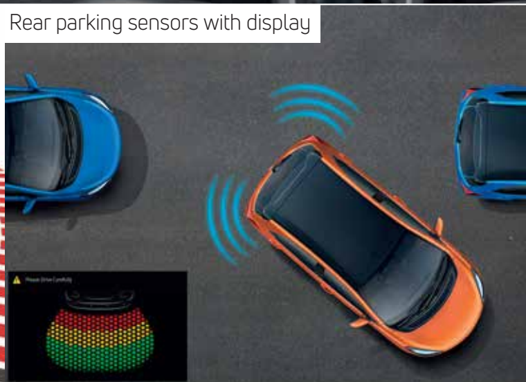
Rear parking sensors with display