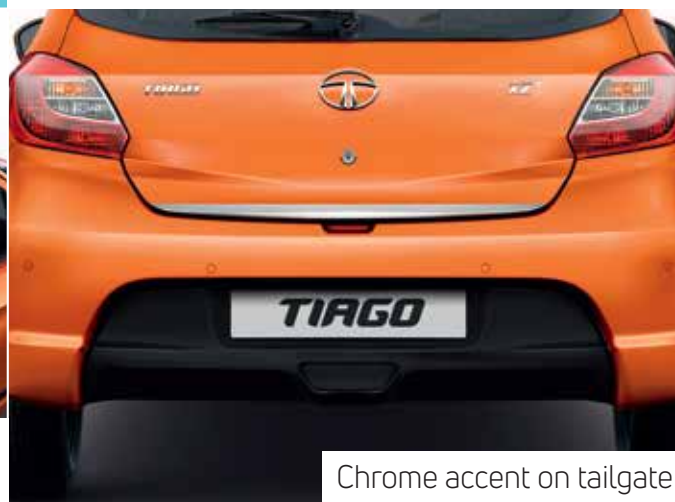
Chrome accent on tailgate