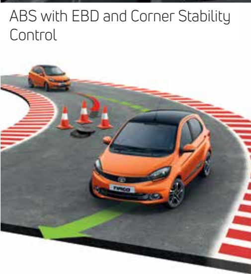
ABS with EBD and Corner Stability Control