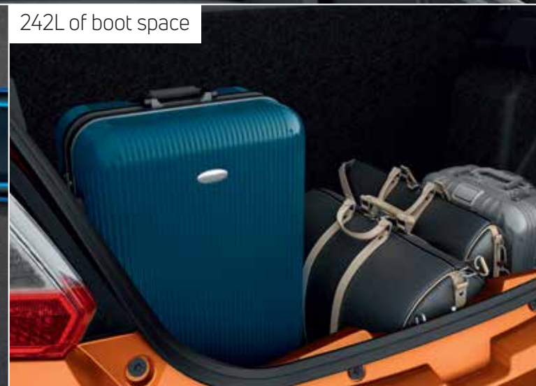
242L of boot space