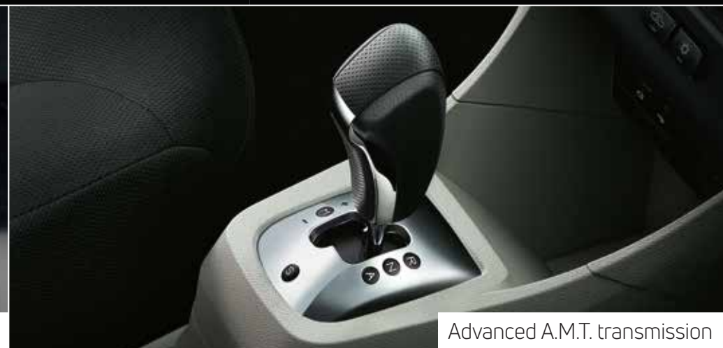
Advanced A.M.T. transmission