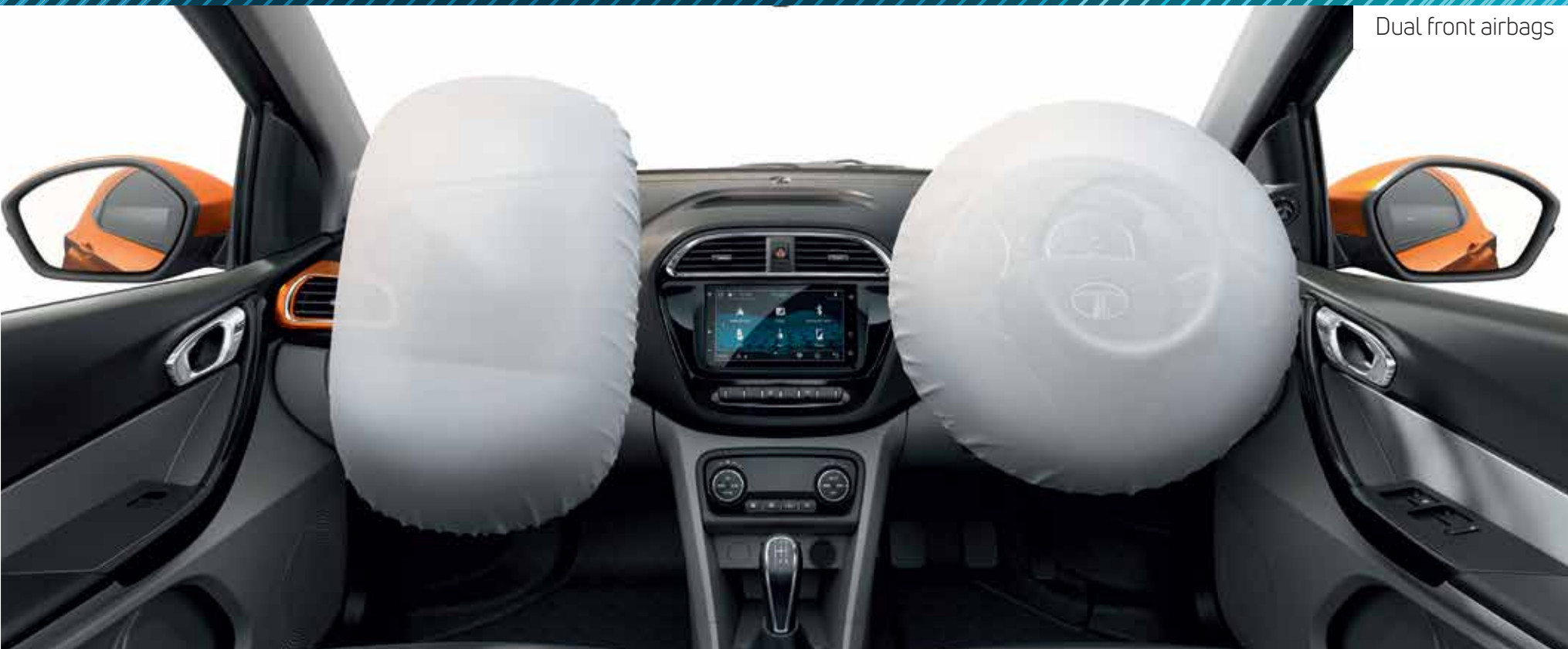
Dual front airbags