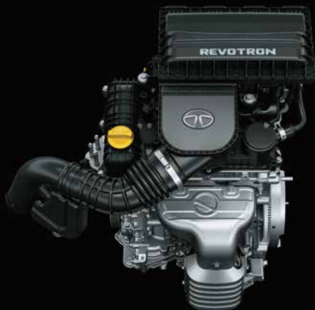
1.2L Revotron Petrol Engine