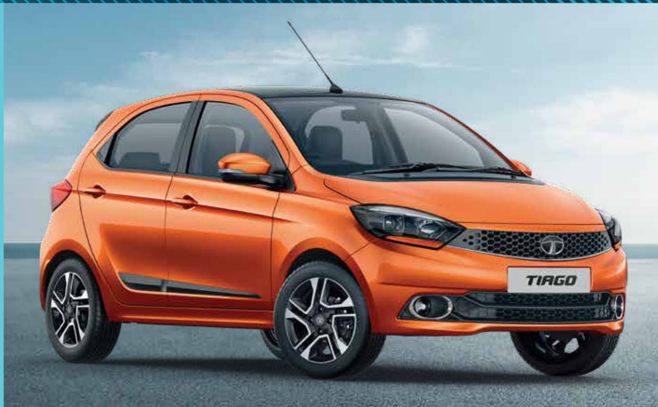
Sporty and sharp 15" Dual tone alloy wheels | Side body moulding | Signature front end design

It's designed to look fresh inside-out, front & back. It's got an exuberant, youthful appeal, which no one can ignore. And it's packed with features that make it even more spirited and young! The Tiago reflects you.