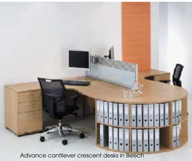
Advance cantilever crescent desks in Beech

Optima is a pleasant furniture system that responds fully to today's challenge of ergonomics, aesthetics and durability. The extensive range of modules available ensures an efficient office solution at a modest cost.