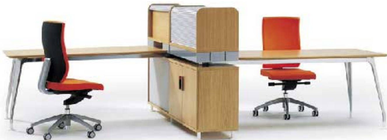
Two person desk unit with supporting personal storage units in Oak/Chrome

This system provides a striking furniture solution for the open-plan office and executive area alike.