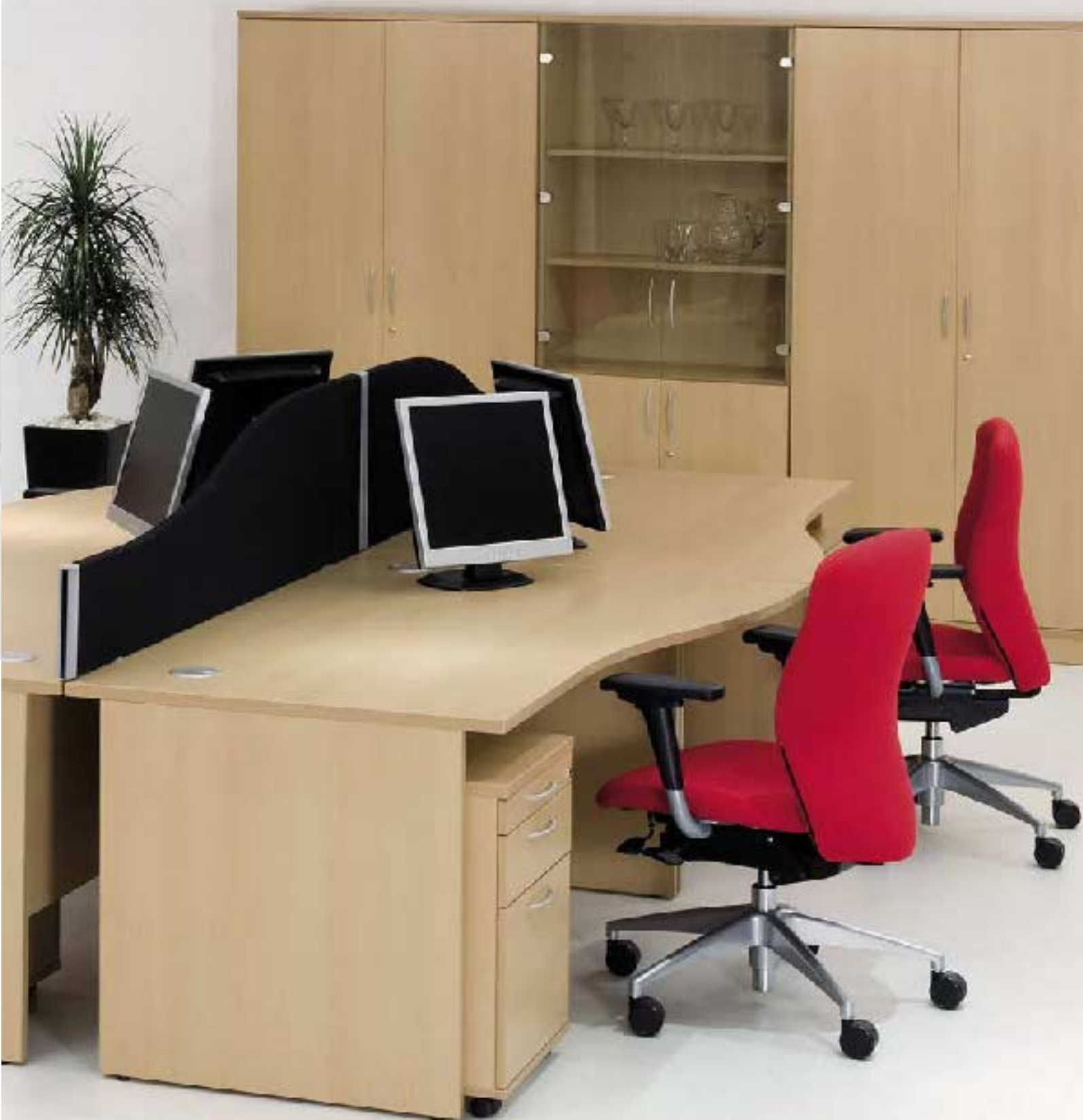
Panel-end wave desks in Beech