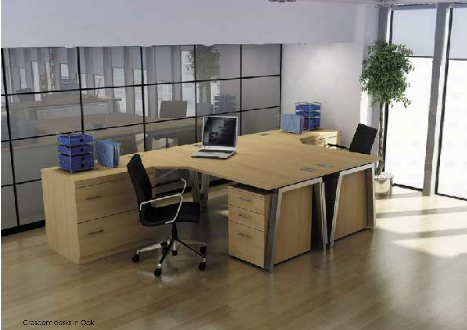
Crescent desks in Oak