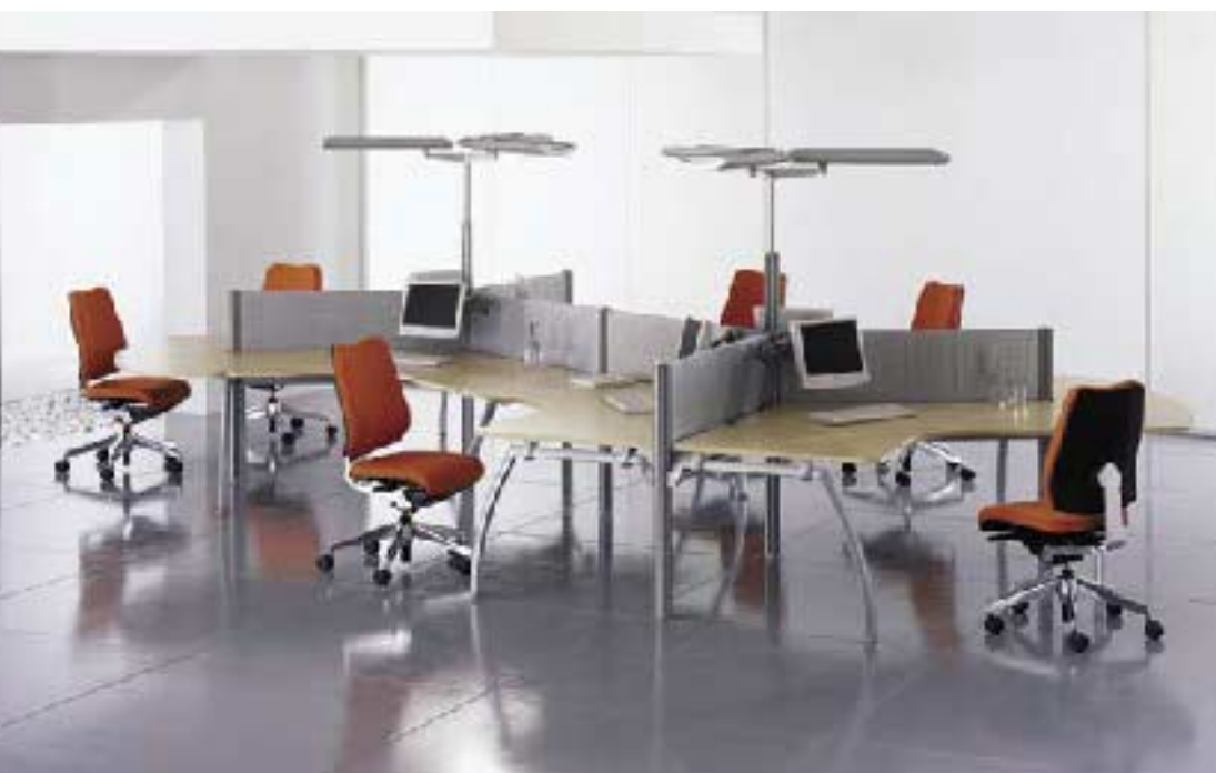
120 Degree desks in Maple