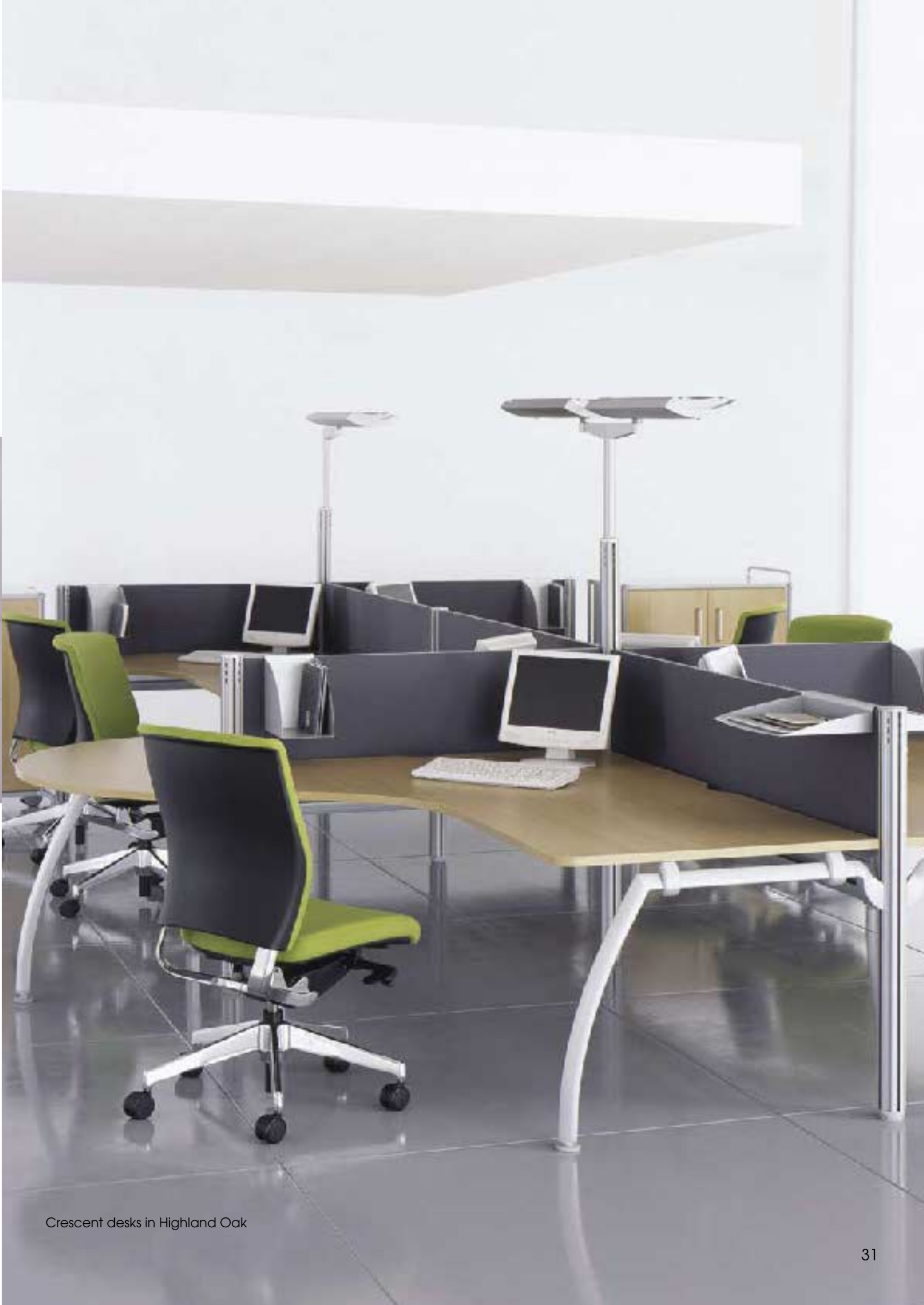
Crescent desks in Highland Oak