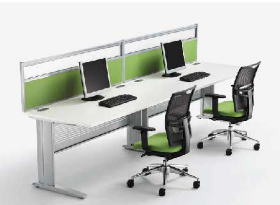
Straight desks in White