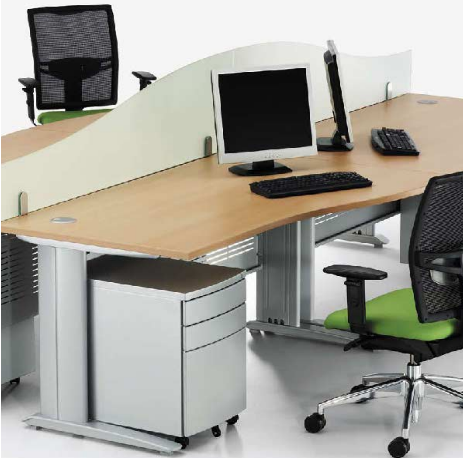
Wave desks in Beech