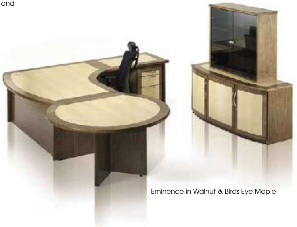
Eminence in Walnut & Birds Eye Maple

Nothing can really replace the beauty of real wood veneers. Traditional craftsmanship and quality materials combine to give executive and corporate areas true class.