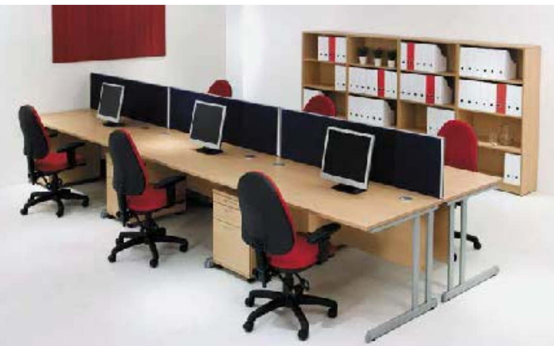
Cantilever straight desks in Beech