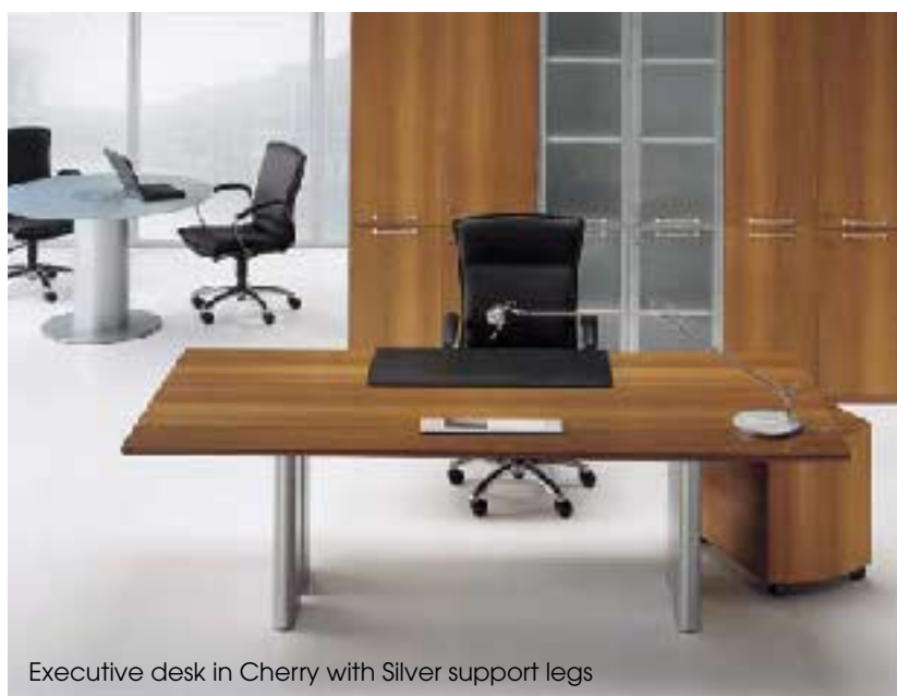
Executive desk in Cherry with Silver support legs