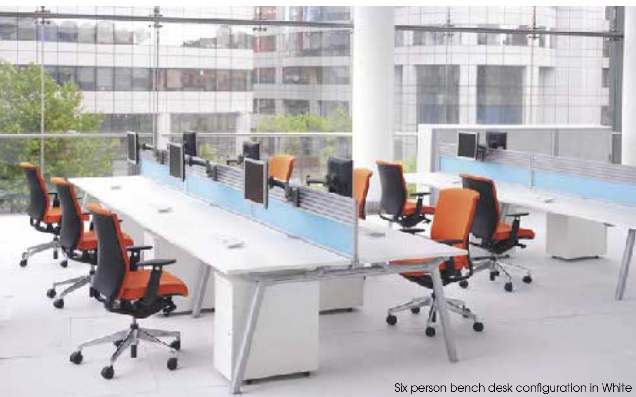
Six person bench desk configuration in White