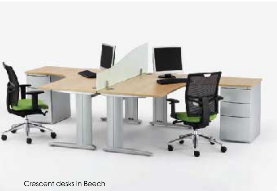
Crescent desks in Beech