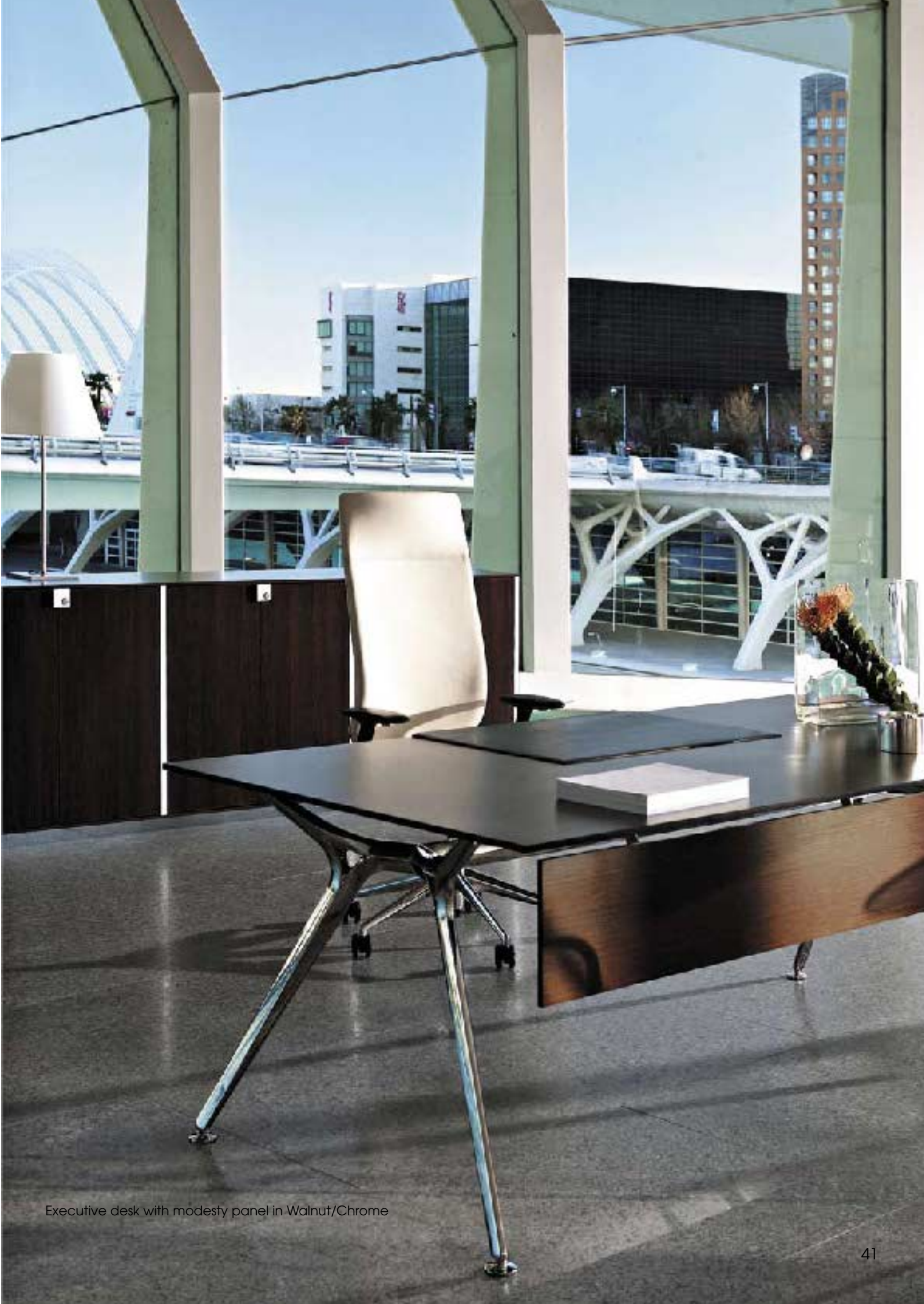
Executive desk with modesty panel in Walnut/Chrome