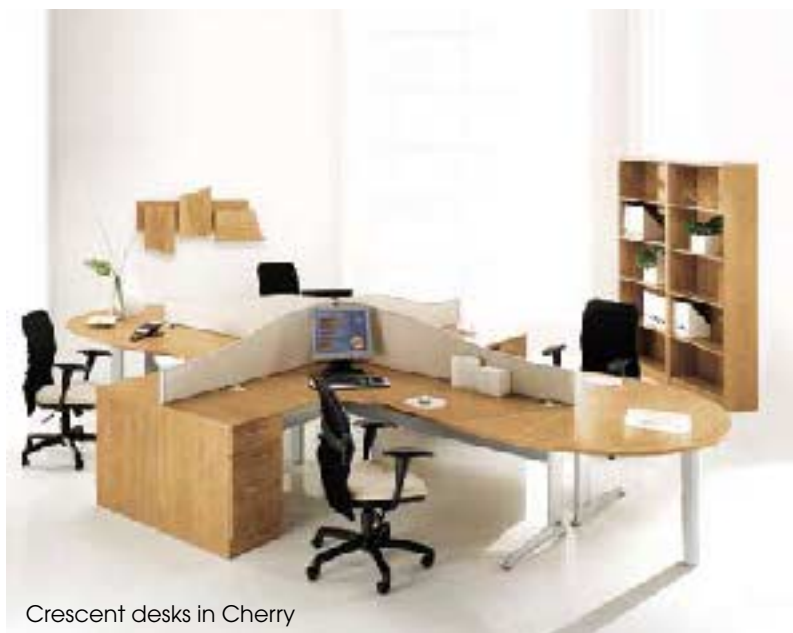
Crescent desks in Cherry