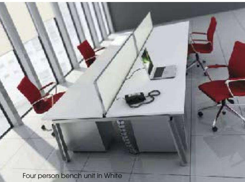
Four person bench unit in White

Archway excels in providing effective cable management solutions and ease of access. Smart sliding work surfaces allow simple and safe entry to the integral cable ways and power modules. Archway's frame structure is strong, easy to assemble and configure.