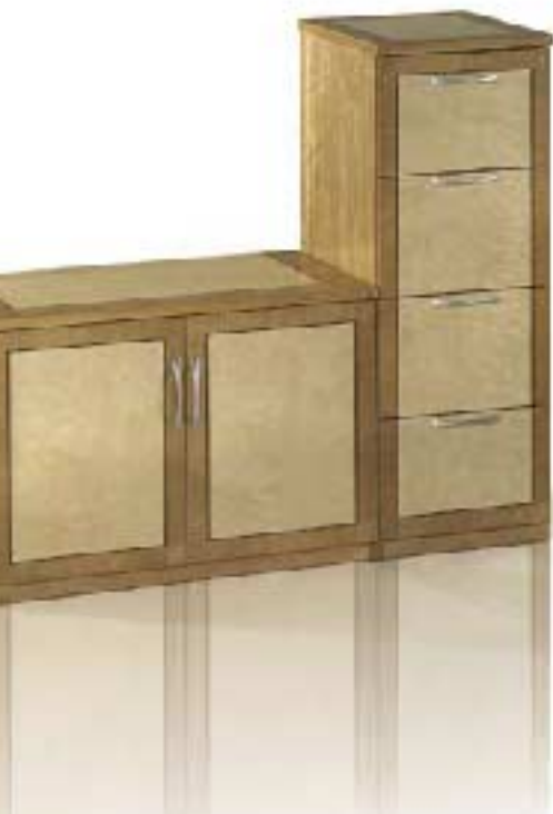
Eminence in Crown Cut Oak & Birds Eye Maple