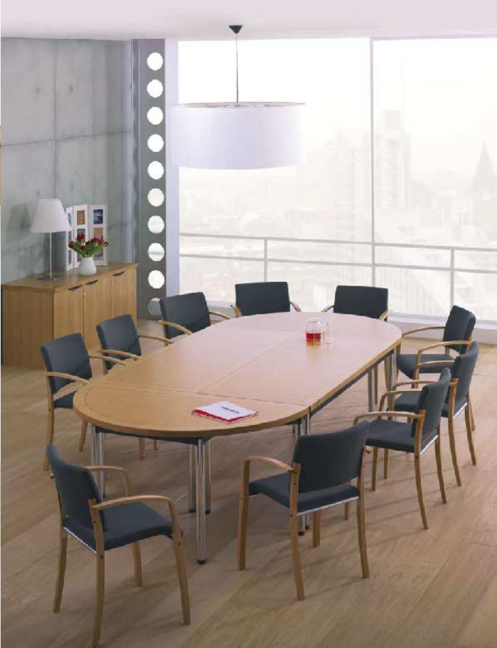
Axiom in Oak veneer with Black line inlay