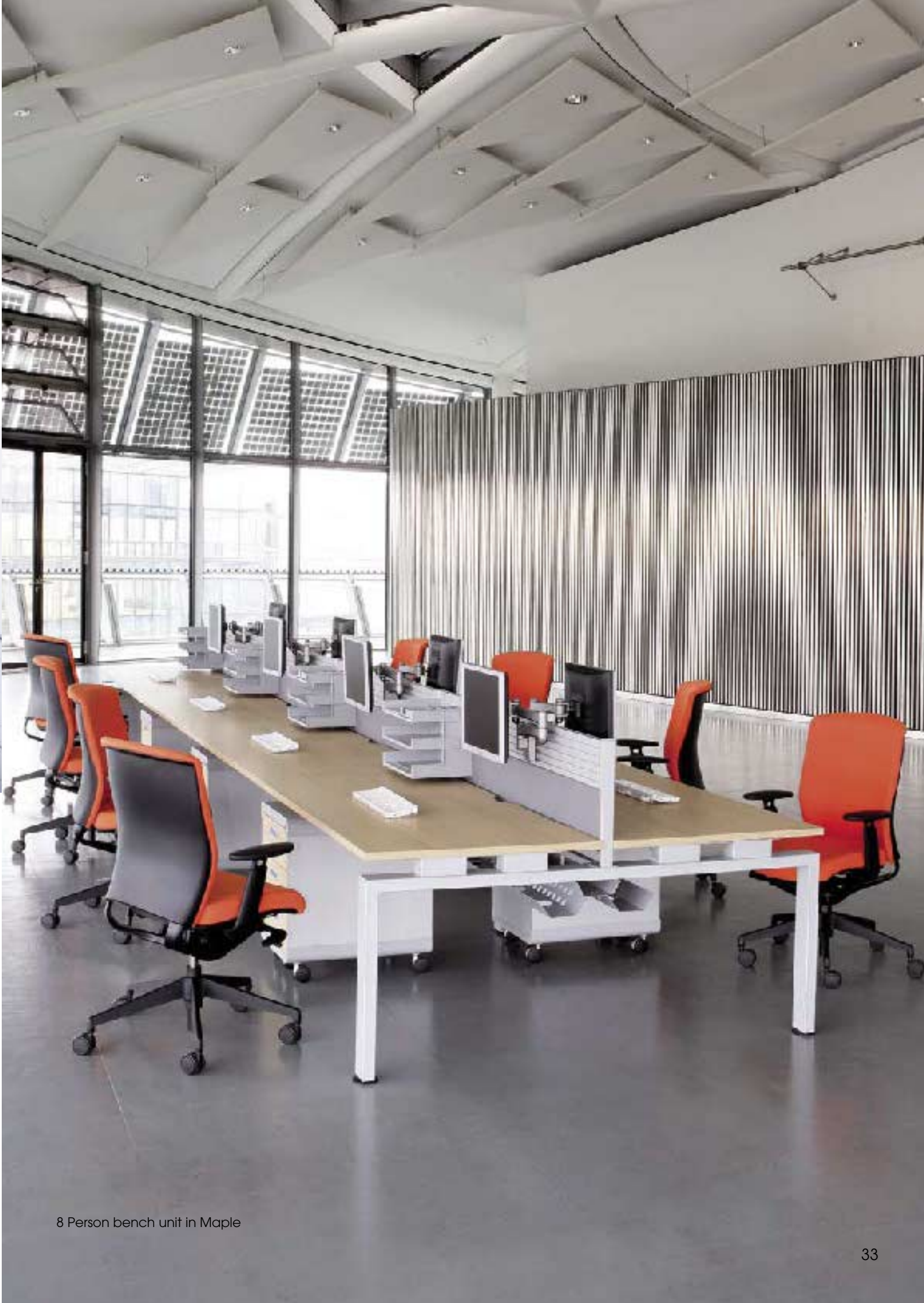
8 Person bench unit in Maple