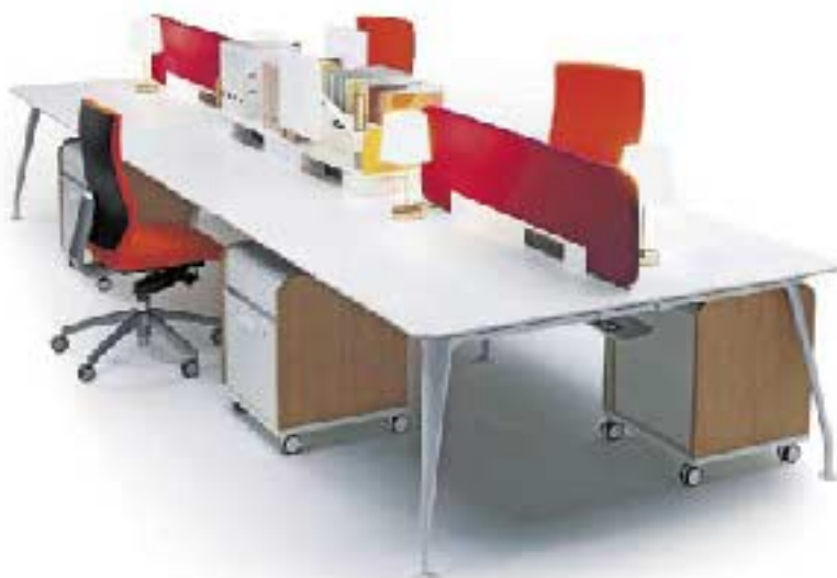
Four person bench unit in White/White