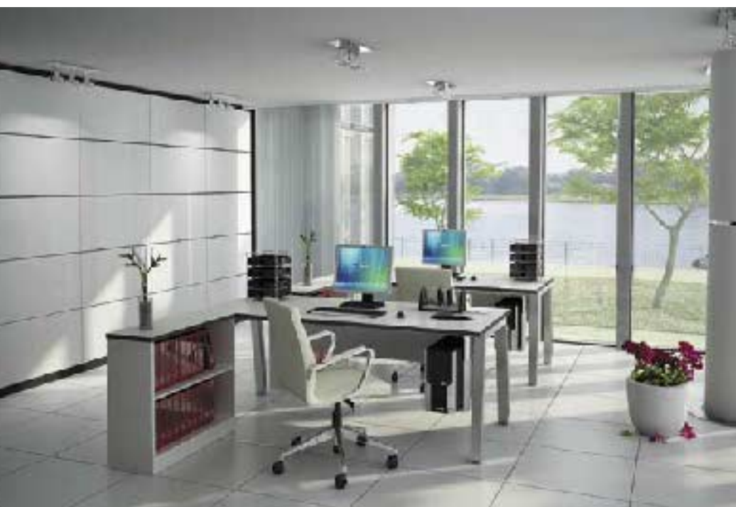
Straight desks with return units in White