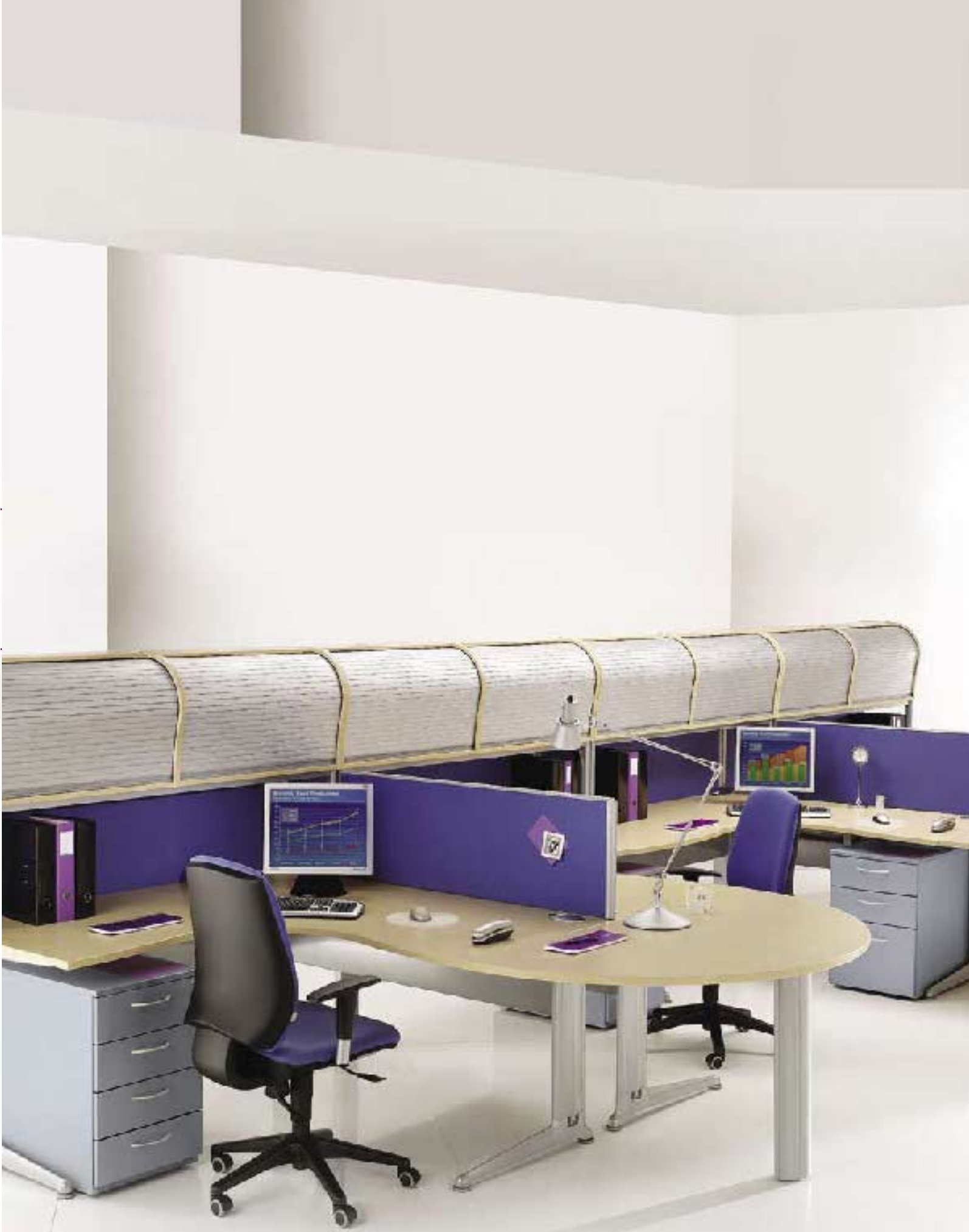
Symmetrical crescent desks in Ash