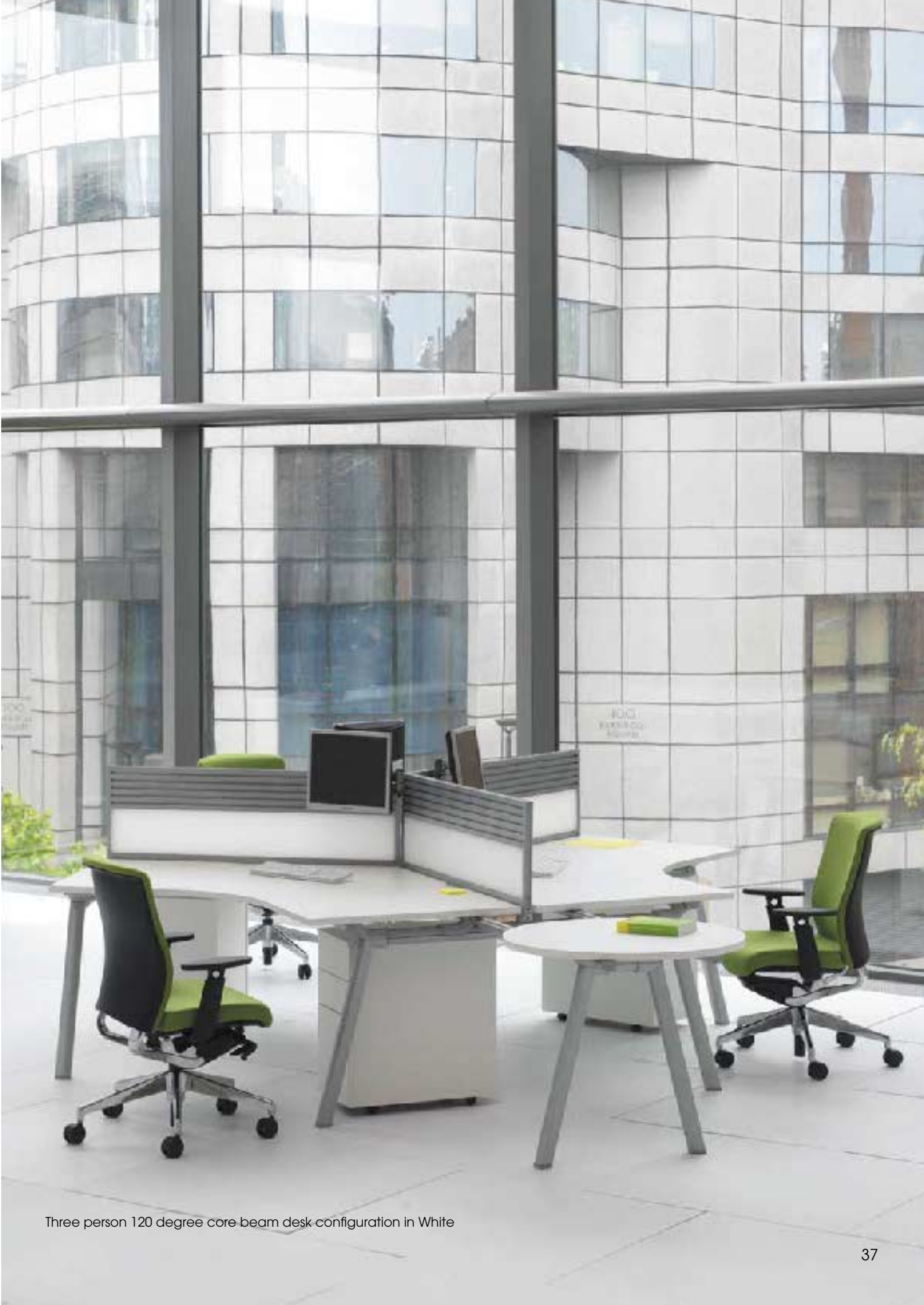
Three person 120 degree core beam desk configuration in White