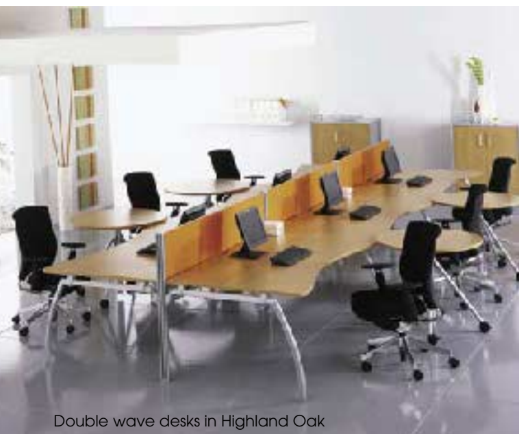
Double wave desks in Highland Oak

Dynamik is an attractive, lightweight beam system combining flexibility and utility. The system has been developed using as few components as possible, all of which are specific to the system making it easy to specify, build, use and upgrade.