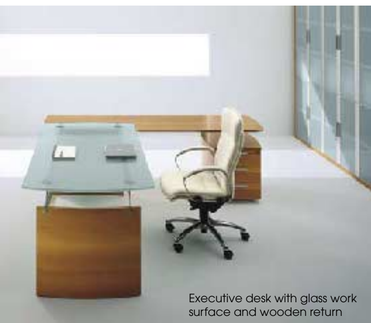
Executive desk with glass work surface and wooden return

Adventurous design and practical solutions combine here to give a truly satisfying range of executive furniture. Many combinations of workstations and storage facilities are available to meet the demands of high level office environments.