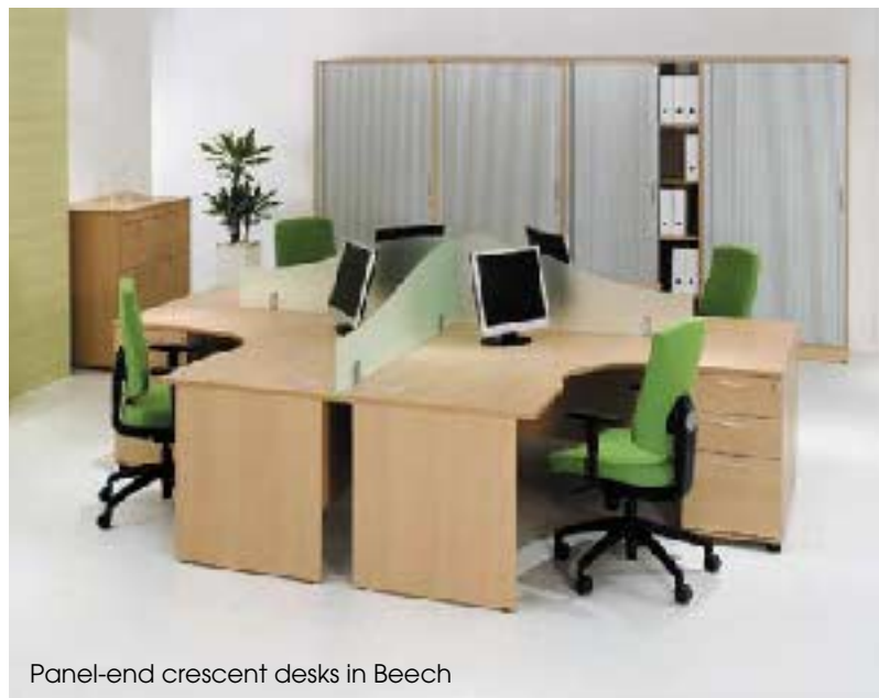
Panel-end crescent desks in Beech