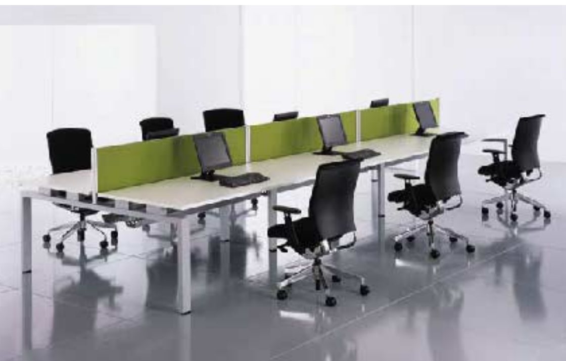
Six person bench units in White