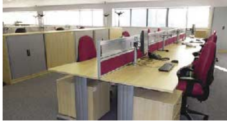
Manufacturer of Dairy Products

The coordination of components that make up a successful interior involves creativity, resourcefulness and understanding. We ensure that design is not just a trendy fad but something that is sustainable. From floor to ceiling our design team will make your interior one to envy, in both aesthetics and function.