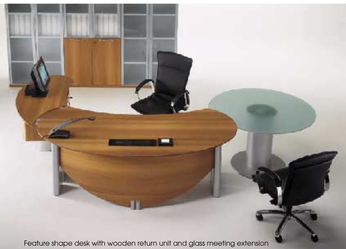
Feature shape desk with wooden return unit and glass meeting extension