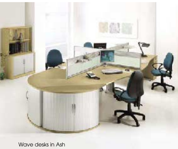
Wave desks in Ash

A highly effective cable management system ensures excellent power and IT routing.