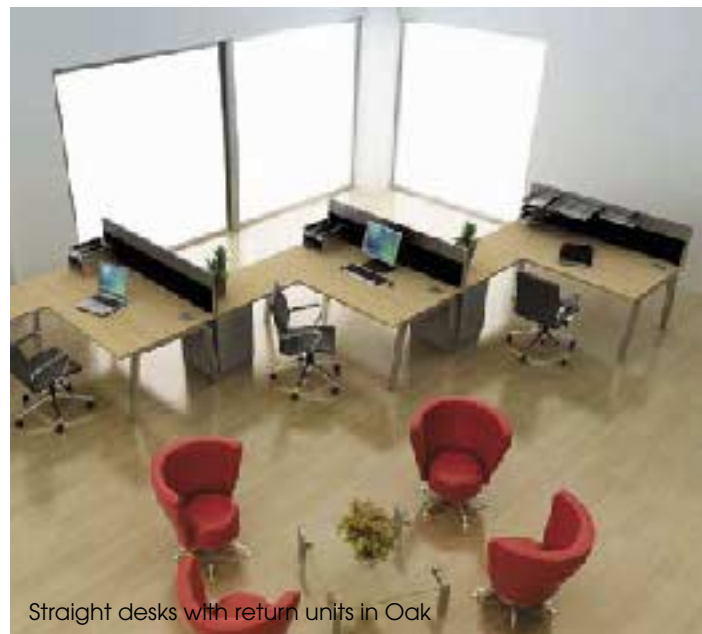
Straight desks with return units in Oak