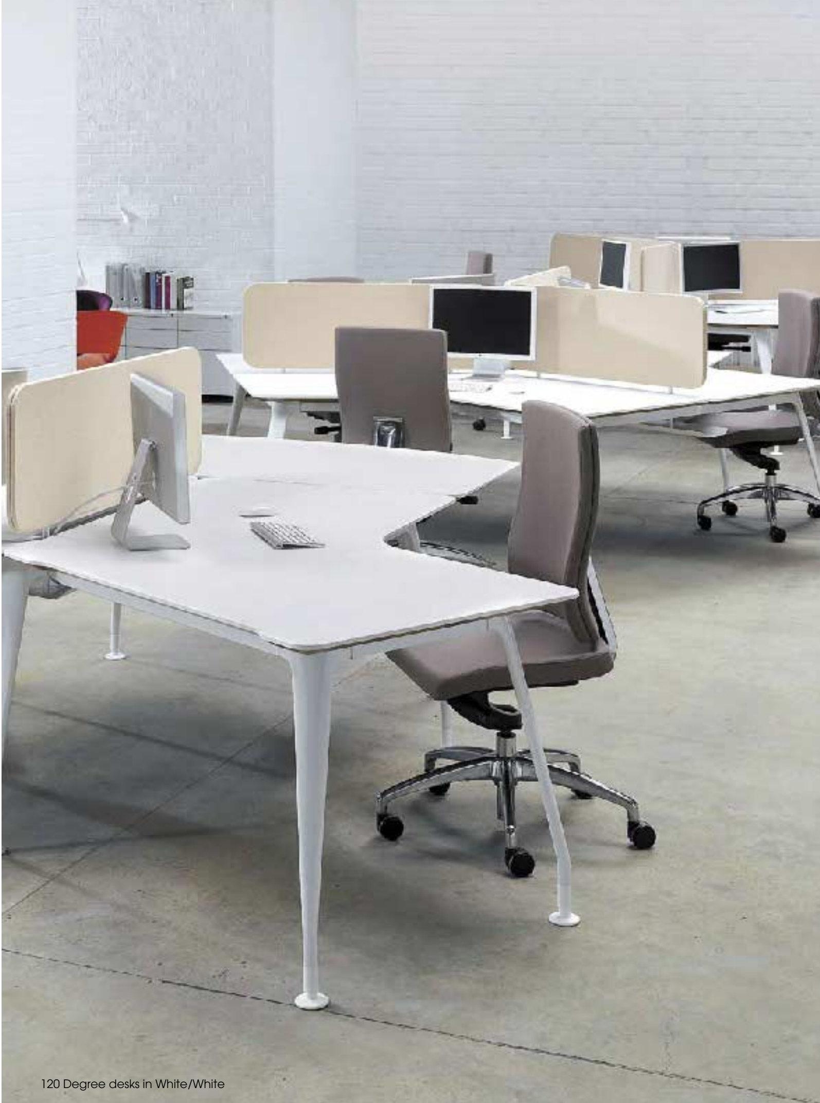
120 Degree desks in White/White