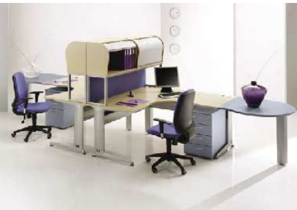
Symmetrical crescent desks in Ash/Blue