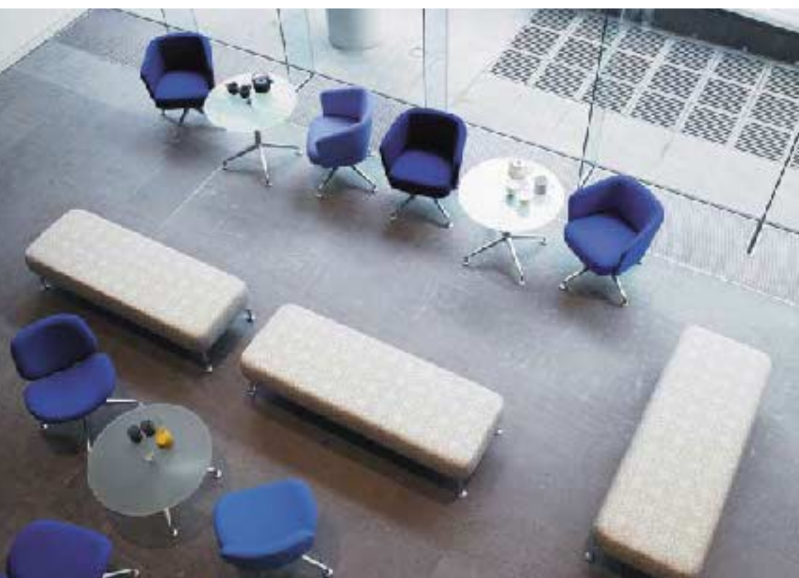
Path, Track & Hay