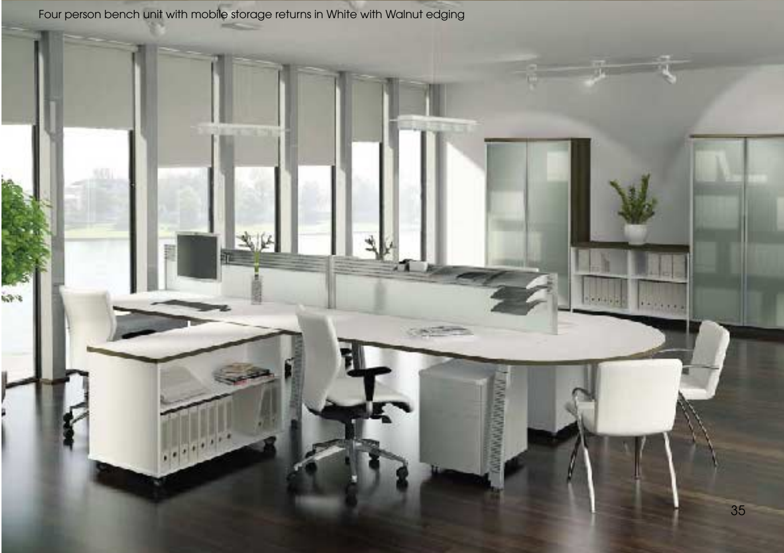
Four person bench unit with mobile storage returns in White with Walnut edging