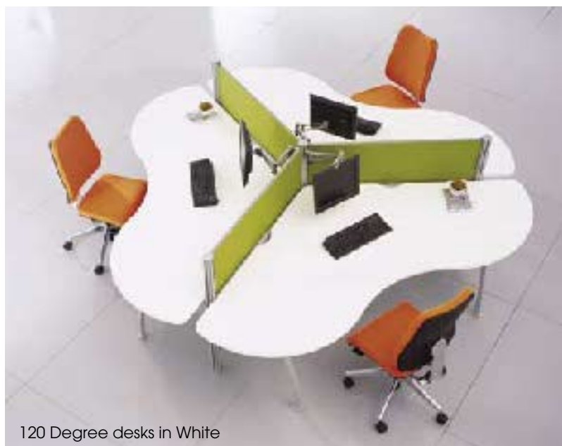
120 Degree desks in White