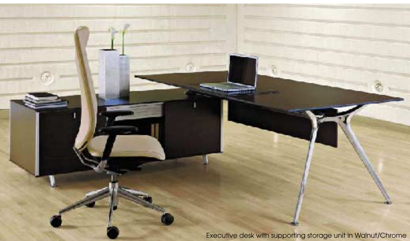
Executive desk with supporting storage unit in Walnut/Chrome