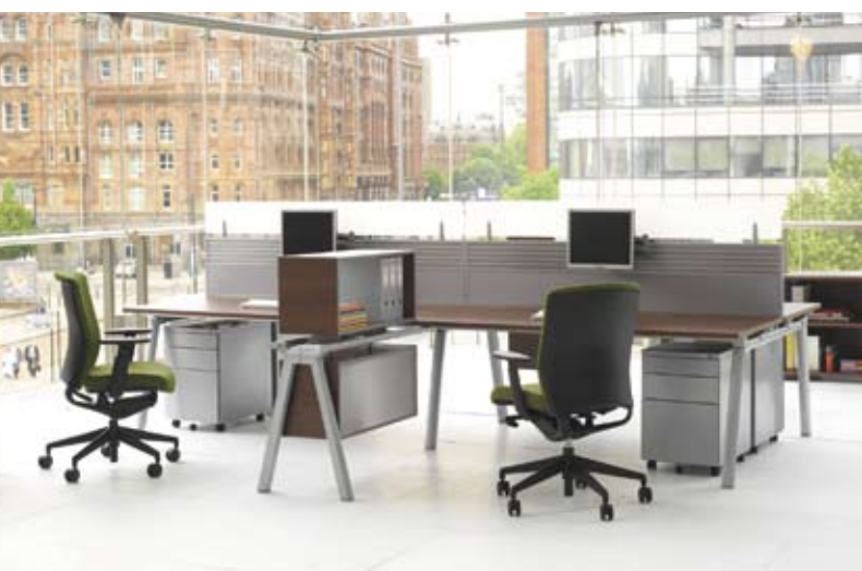
Four person core beam desk configuration in Walnut