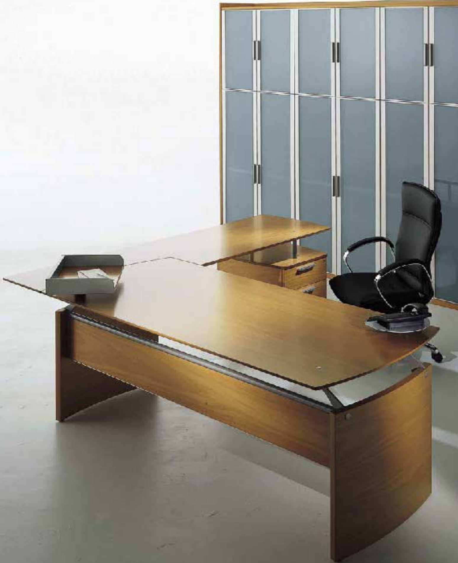
Executive desk with pedestal supported return unit in Cherry