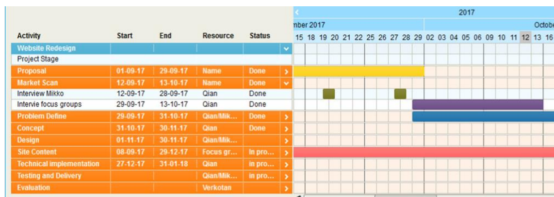
Figure 2 Website action plan using smartsheet (smartsheet 2018, date of retrieval 14.2.2018)

The following figure 2 is the schedule, which shows completed tasks of the new website project. The new website project went through information gathering (interviewing), planning, designing, content production, coding phrase, and will be launched once the testing, reviewing and content updates are completed.