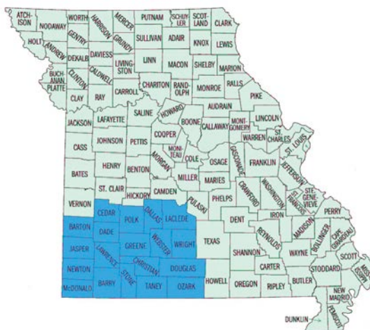
Marketing Partnership Region