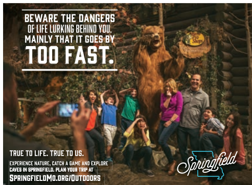
Bass Pro Shops – “Gateway to the Great Outdoors”

All advertisements will feature a single element found within the brand experience categories identified in the brand architecture on page 7 of this document. Although additional photo assets will be collected during FY17, the following print ads are representative of the type of ads that may be use in the FY17 campaign.