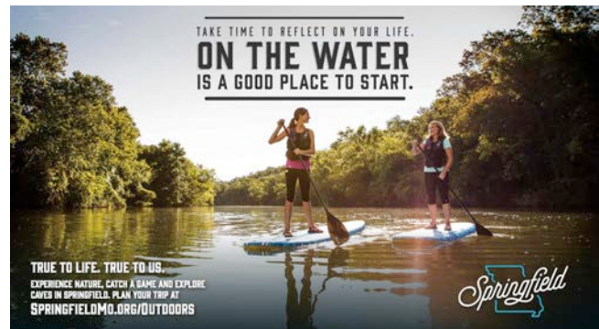
Lake Springfield – “Gateway to the Great Outdoors”