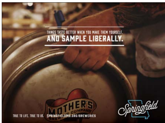
Mother's Brewing Company – “Homegrown Innovation”