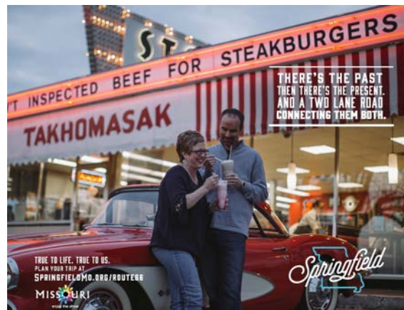
Route 66 – “Classic Americana”