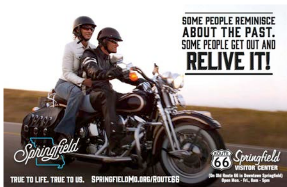
Route 66 – “Classic Americana”