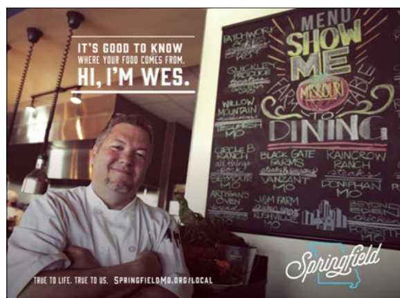
Metropolitan Farmer – “Pulse of the Ozarks”