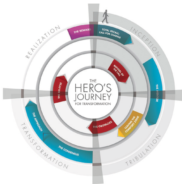
Figure 2: A universal story plot after Joseph Campbell's The Hero's Journey, Source: Flickr.com, 2017.

To ensure that your 'story' follows a plot, Joseph Campbell's The Hero's Journey detailed below, is a useful reference point.