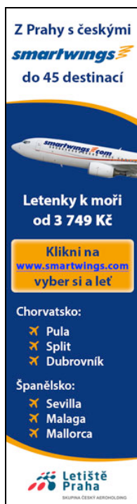
Figure 3 SW banner 2014 – Email Skyscraper preview