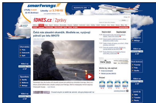
Figure 1 SW banner 2014 – iDnes Branding preview