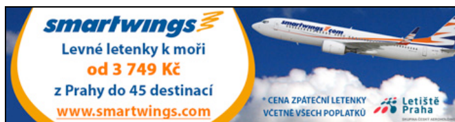
Figure 2 SW banner 2014 – Seznam Homepage preview