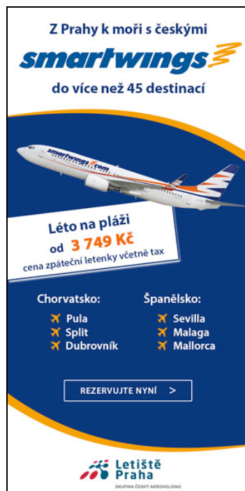
Figure 4 SW banner 2014 – Novinky Skyscraper preview