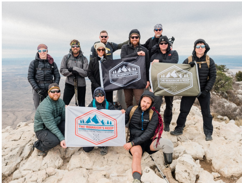
FP2020 team training at Guadalupe Peak, highest point in Texas! 2/2/20

After a thorough and comprehensive selection/interview process, The Warrior's Keep selected a group of 15 veterans. The team will train for 5 months and be required to attend mandatory training events. All flights and expedition costs are covered 100% by The Warrior's Keep.