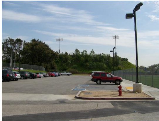
EGA #7: E5 Lot Looking South.

Staff parking lot E5 has only one access, making through traffic impossible and safer than most parking lots on campus, and hence potentially an evacuation area. It is the only sizeable area that is not fenced or in a busy vehicular traffic area on the East end of campus. If the football practice field next to E5 is unlocked, it could also be considered part of EGA #7 . This area could potentially serve all buildings on the east side of campus, including PE, AQ, AP, DT, TD, TE, PS, HH and AA.