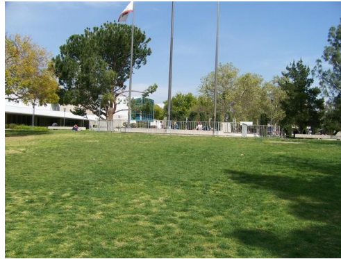
EGA #1: Campus Mall Center

EGA #1 - CAMPUS MALL - AT THE FLAGPOLE The highly visible, grassy area just west of the Flagpole and fountain could serve buildings LI, LB, and CC. Possibly AD, LH, LS, and PS could utilize this EGA as needed.