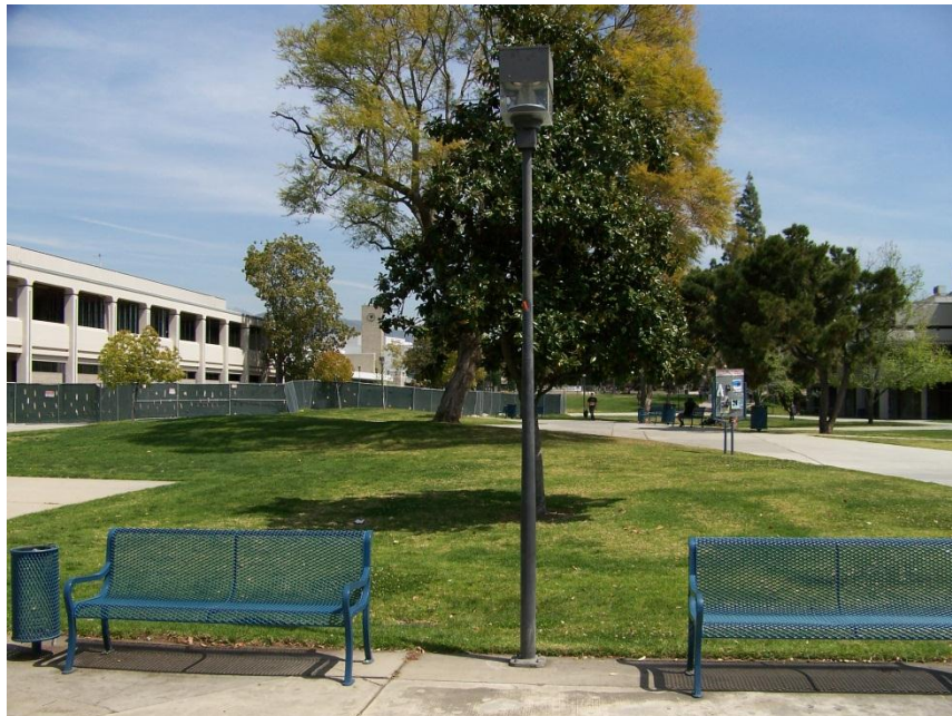
EGA #2: Looking East with the AD building to the left