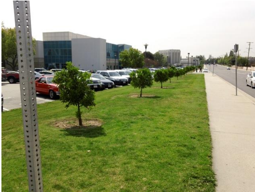
EGA #5: Looking West along Foothill Blvd.

This location also located along Foothill Blvd, would serve LI, CI, CC, LH, and ES buildings. Due to the density of buildings on campus in this area, the orange tree strip is the only open space that is available that meets the ‘150 foot rule’.