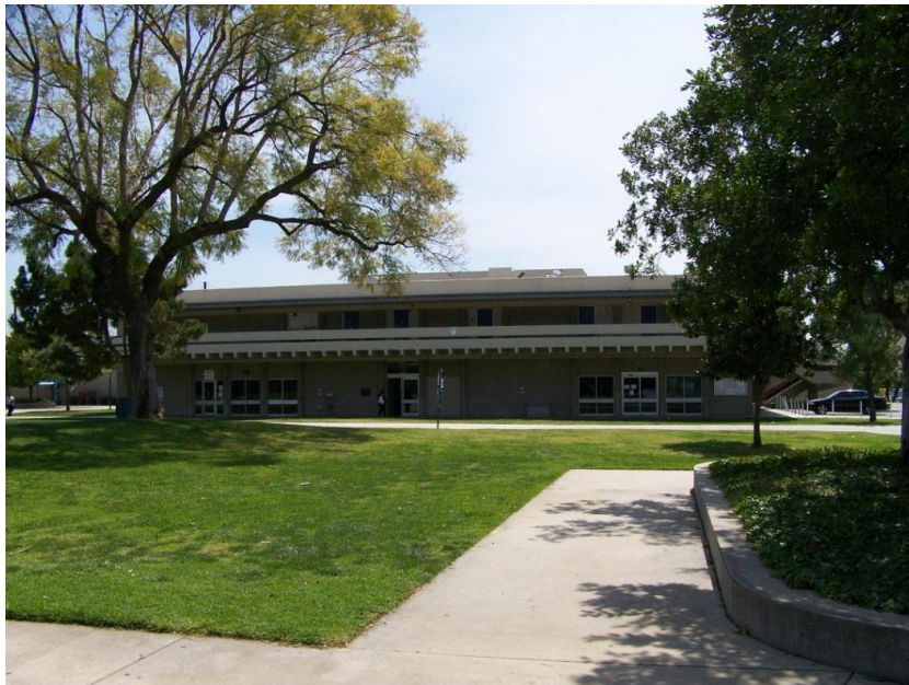
EGA #2: Viewed from the North looking South toward the ED Building.

This EGA can serve buildings ED, PA, RA, AD and AC as needed. While the area is small and tightly bound by buildings on the campus mall, it is likely to be very serviceable as an initial evacuation site, and for evacuation drills.