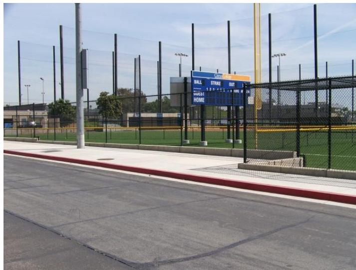
EGA #9: Looking South and East