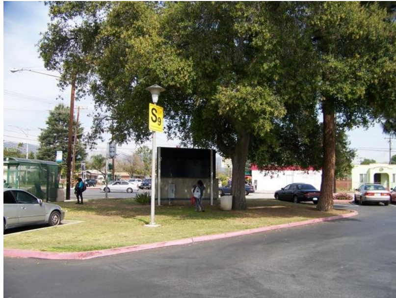
EGA#6: Green space/Campus Marquee Mound; Looking East and North.

This Green mound is at the extreme NE corner of the campus. Parking lot traffic in ‘S9’ complicates finding an acceptable space for an EGA for this area. Sidewalk access is available for most buildings, including: MA, PC, TC, TD, TE, DT, AA, RG, HH, and P1.