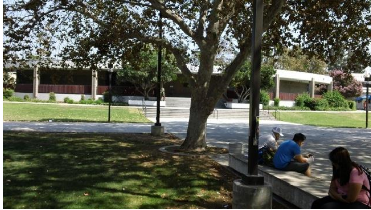
EGA #10: Looking East toward the LH Building

This small open grass and sidewalk area is tightly bordered by three buildings and can serve as an EGA for any one of the three buildings - CC, LI, and LH. ( NOTE: EGA #10 does not meet the required 150 evacuation foot print if all three buildings must be evacuated simultaneously).