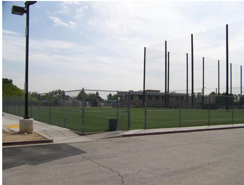
EGA #7: Adjacent Football Practice Field.