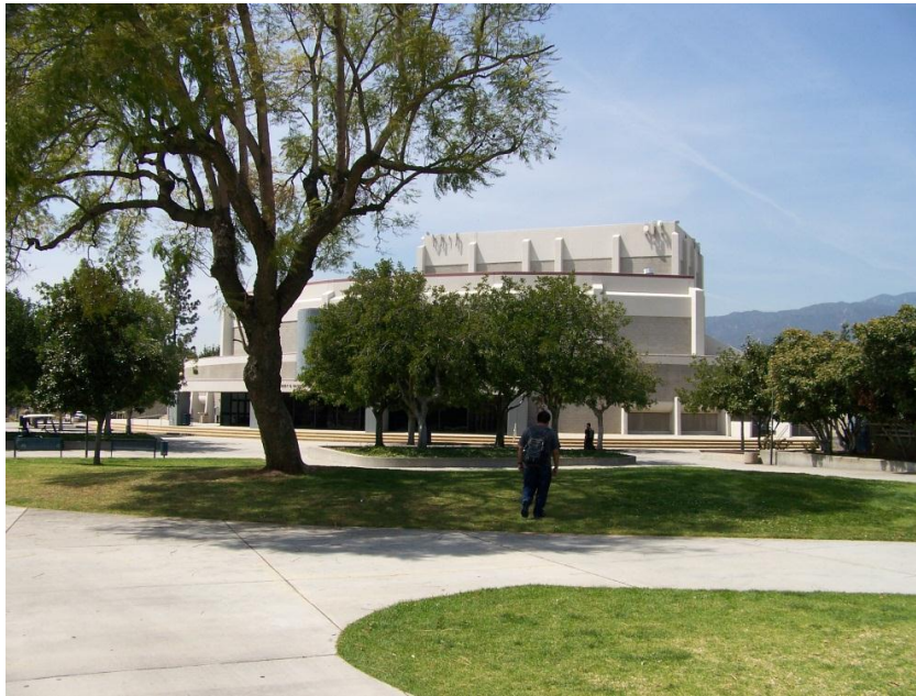
EGA #2: Viewed from the East, looking West at the Haugh Performing Art Center