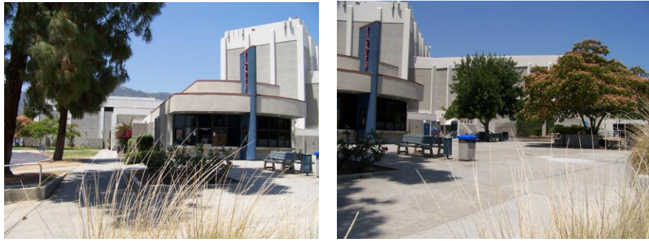
Sidewalk West Along the SS Building to EGA #3