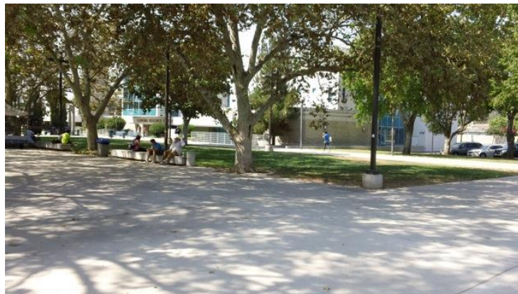
EGA #10: Looking Northwest from Campus Center Quad to the north end of the LI Building