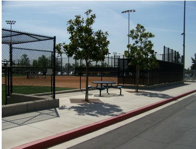
EGA#9: Looking West across from IS building

There is long sidewalk with seating alcoves on the perimeter of the Softball and south of the IS building. This area could serve CC, IS, LB. CC, BK and the surrounding athletic areas near the EGA location depicted.