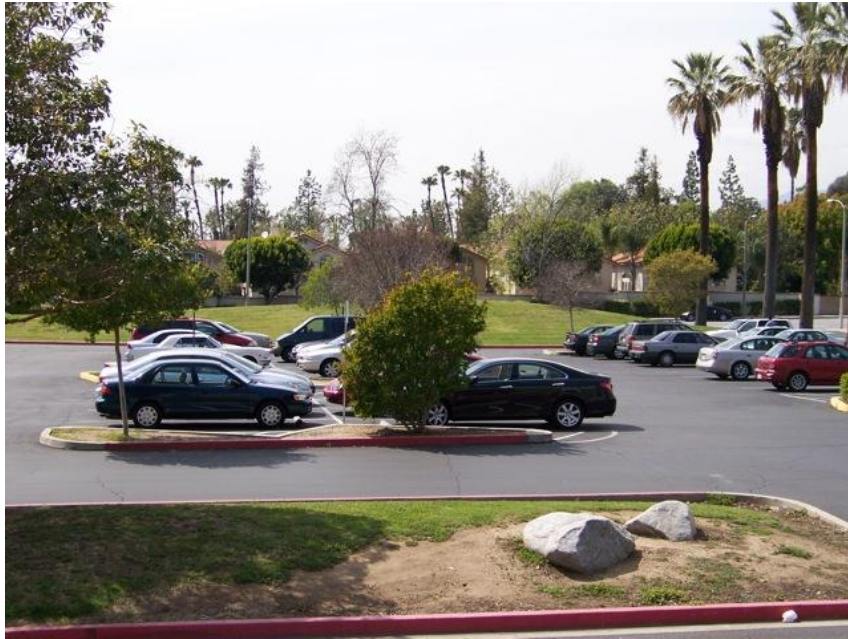
EGA #3: Viewed from Student Services Building

Access to EGA #3: Follow the sidewalk access from local departments such as; PA, Drama, PA Box Office, SS, AC, and LL to this EGA. The following series of photos demonstrate a generally safe access route: