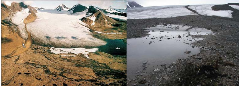
Figure 1: Spitsbergen glacier (left) and one of the sample location (right)