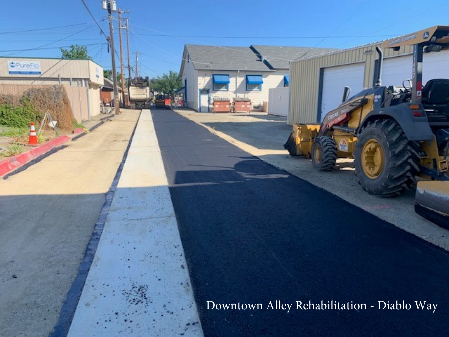
Downtown Alley Rehabilitation - Diablo Way