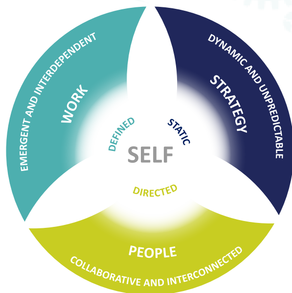
The SELF Model

To close the strategy-execution performance gap, leaders must learn to successfully navigate away from the model's former styles of getting work done to the current outer rim styles across these three domains.