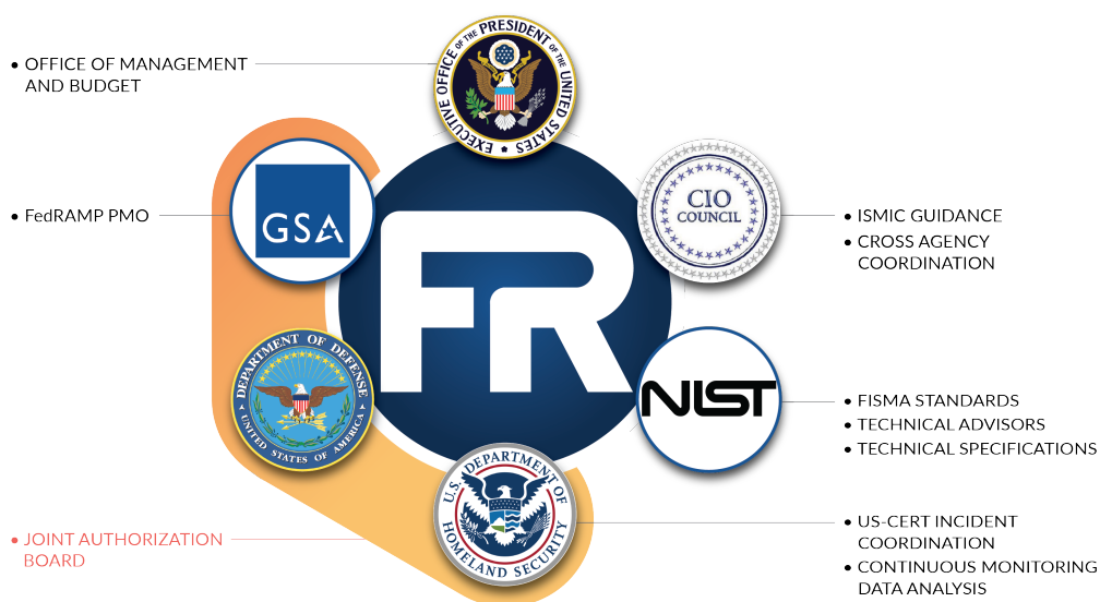
Figure 1 – FedRAMP Governance Entities

Figure 1. FedRAMP stakeholders are those individuals and teams with a vested interest in the implementation and operations of FedRAMP. The FedRAMP Policy Memo outlined stakeholder responsibilities that have been further delineated in the Joint Authorization Board (JAB) Charter. FedRAMP stakeholders and their responsibilities are described in the sections that follow. A summary of stakeholder responsibilities can be found in Table 1 of this document.