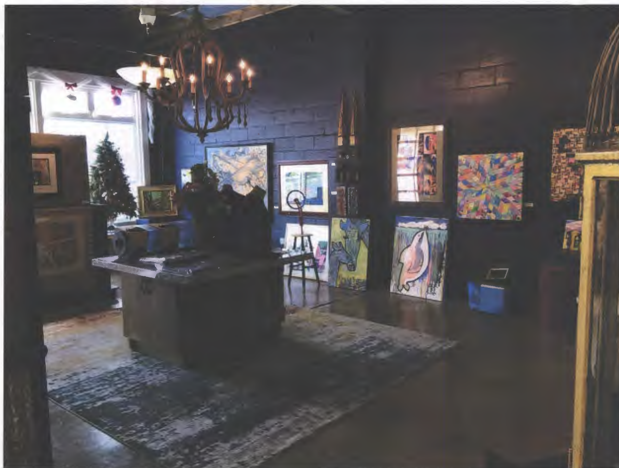
Exhibit 1: JTM Art Gallery