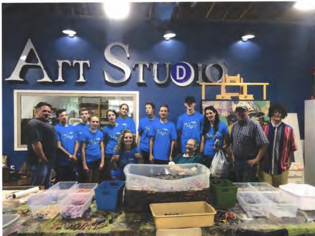
Figure 1: Jump the Moon Foundation: Main Office

workshop, 300 sq. ft. of storage, and 200 sq. ft. for an office. The location provides enough space to accomplish the goals of the programs along with enough space for their employees (see Figure 1 ).