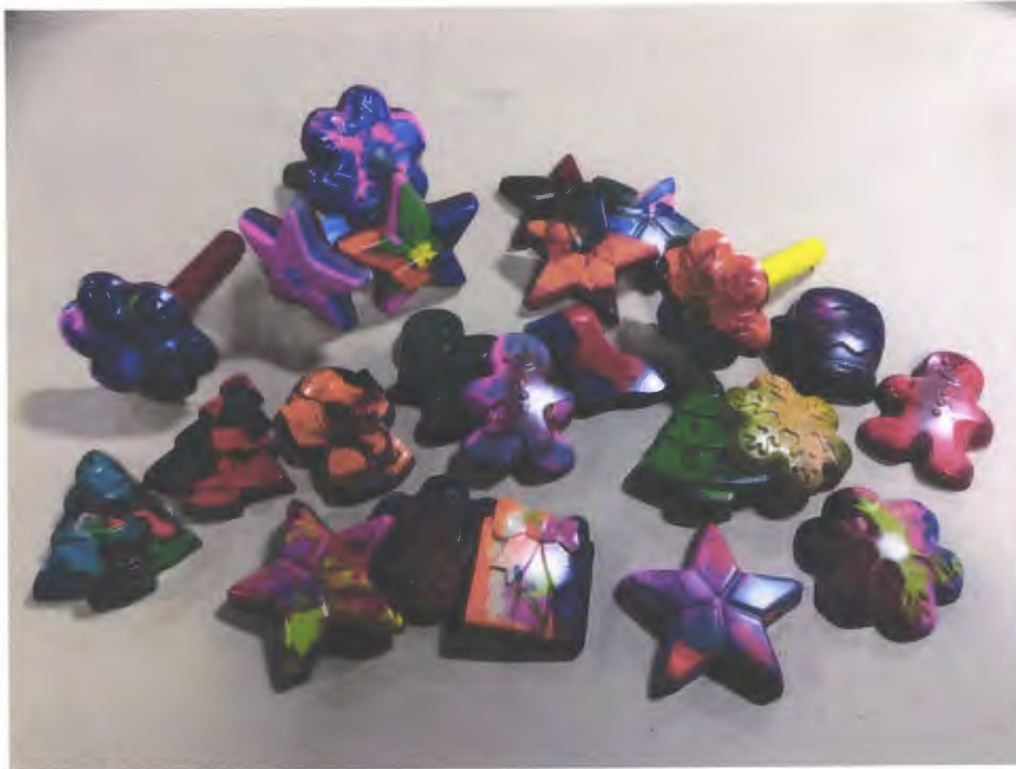
Exhibit 9: Doodle Bells