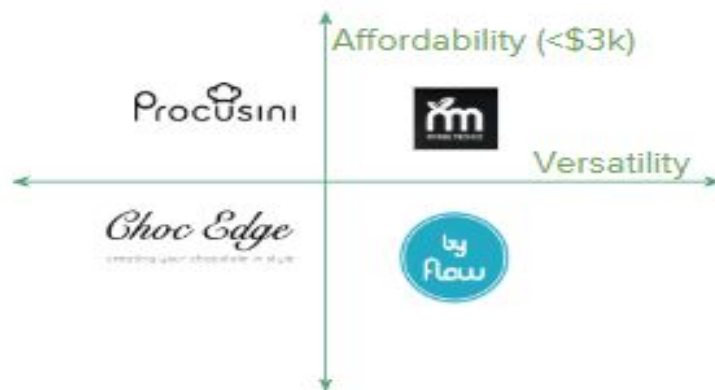
Figure 5: Product Positioning Map

The 3D food printing industry is in the early stages, with competition ramping up. As detailed in section 4, Competitor Analysis, we will be positioning Foodini 2.0 against products with similar functionality; ChocEdge, ProcuSini and byFlow. The Foodini is well positioned against the competition, having a combination of more versatility and an affordable price. Foodini 2.0 is currently the only 3D food printer with IoT functionality. With a no questions asked return policy and 2 year warranty, Foodini stands out amongst the competition as a trustworthy product. We believe that IoT and the Foodini Design Library will make Tech Hobbyist connect emotionally to Foodini 2.0. The vast collection of designs accessible in the Foodini Design Library will enable the Tech Hobbyist to create fun food creations that they can be proud of.