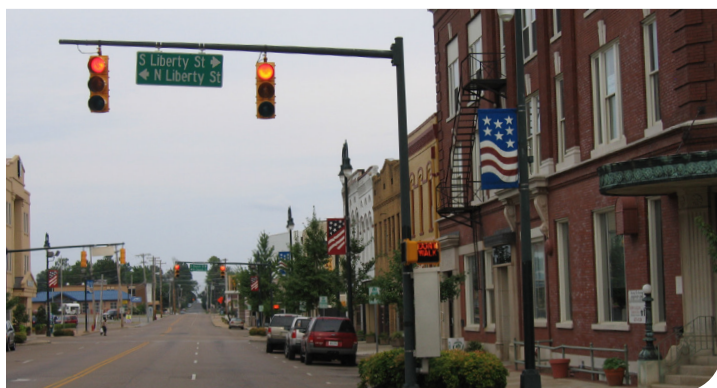
Traffic Signal Coordination