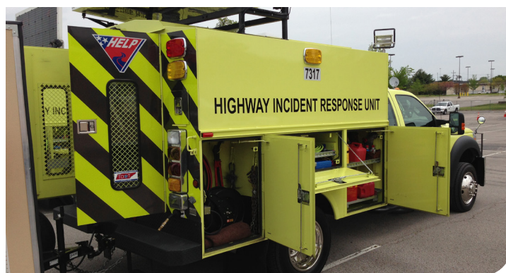
Freeway Service Patrol