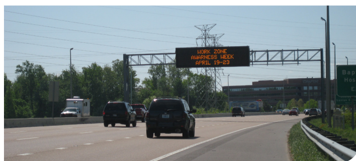
Dynamic Message Signs