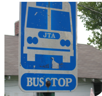
Transit Vehicle Tracking and Real-Time Information