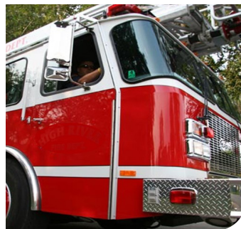
Emergency Vehicle Traffic Signal Preemption

An ITS Deployment Plan identifies the projects that need to be implemented in order to meet ITS needs and deliver the ITS services identified in the Regional ITS Architecture.