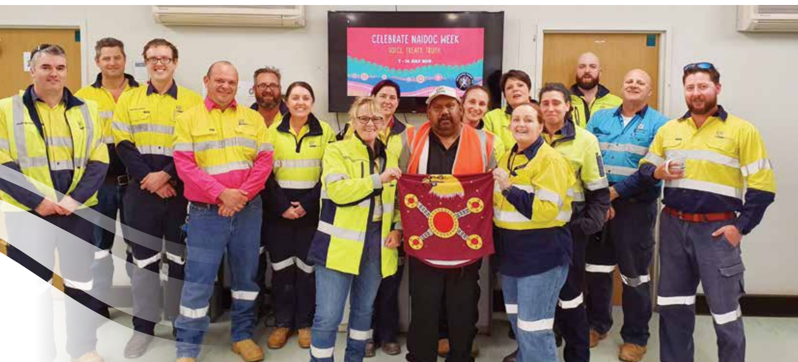
St Ives team celebrating NAIDOC Week.