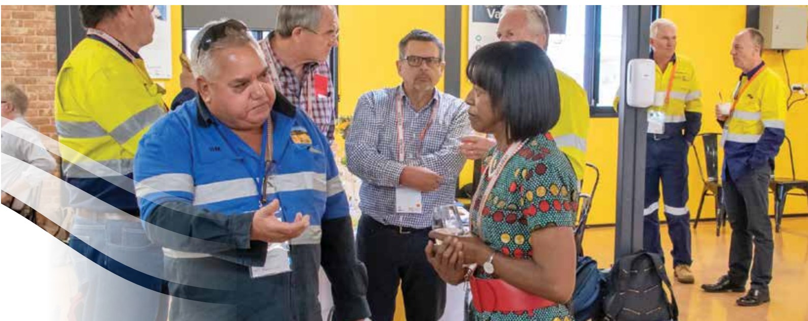
Chair of the Yilka Talintji Aboriginal Corporation with the Chair of Gold Fields Limited at the official Gruyere Mine opening in December 2019.