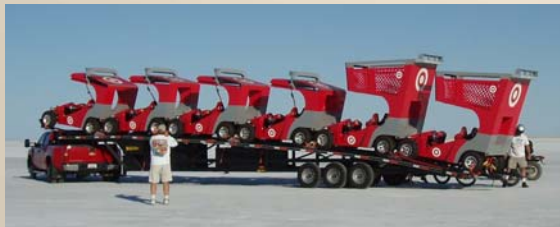
Target Corp. was on the Salt in 2010

Act now! You can reap the benefits of this emerging opportunity