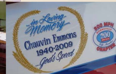
Tribute to Chauvin 2009