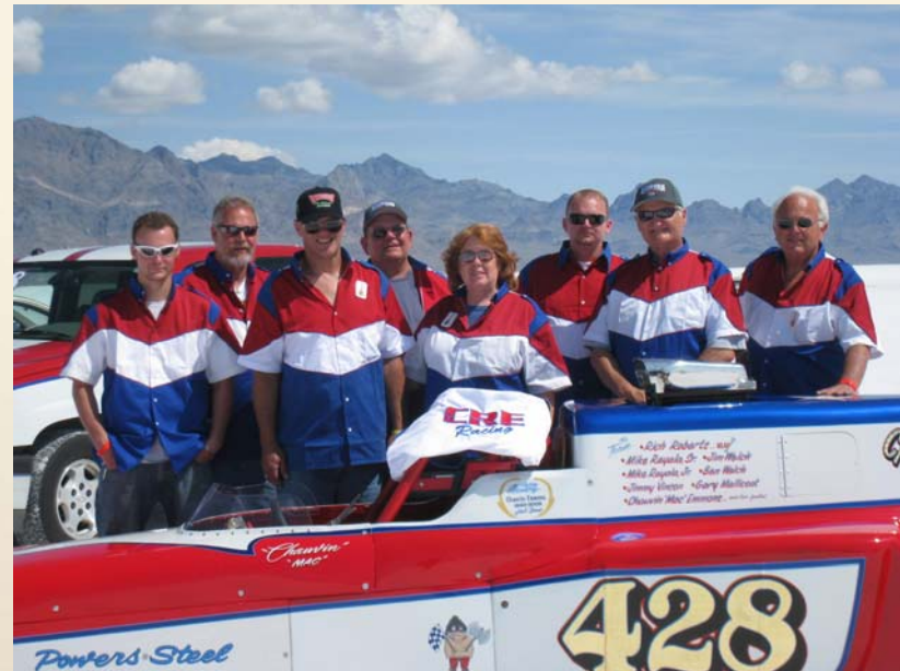
The CRE Team