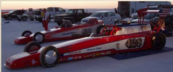
Our old car 422 and 428 sitting side by side in impound waiting to make an early morning record run 8/18/2010

"Folks, you're witnessing history being made... #428 the Emmons Special is the World's Fastest Roadster!" Speed Week track Announcer 8/16/10