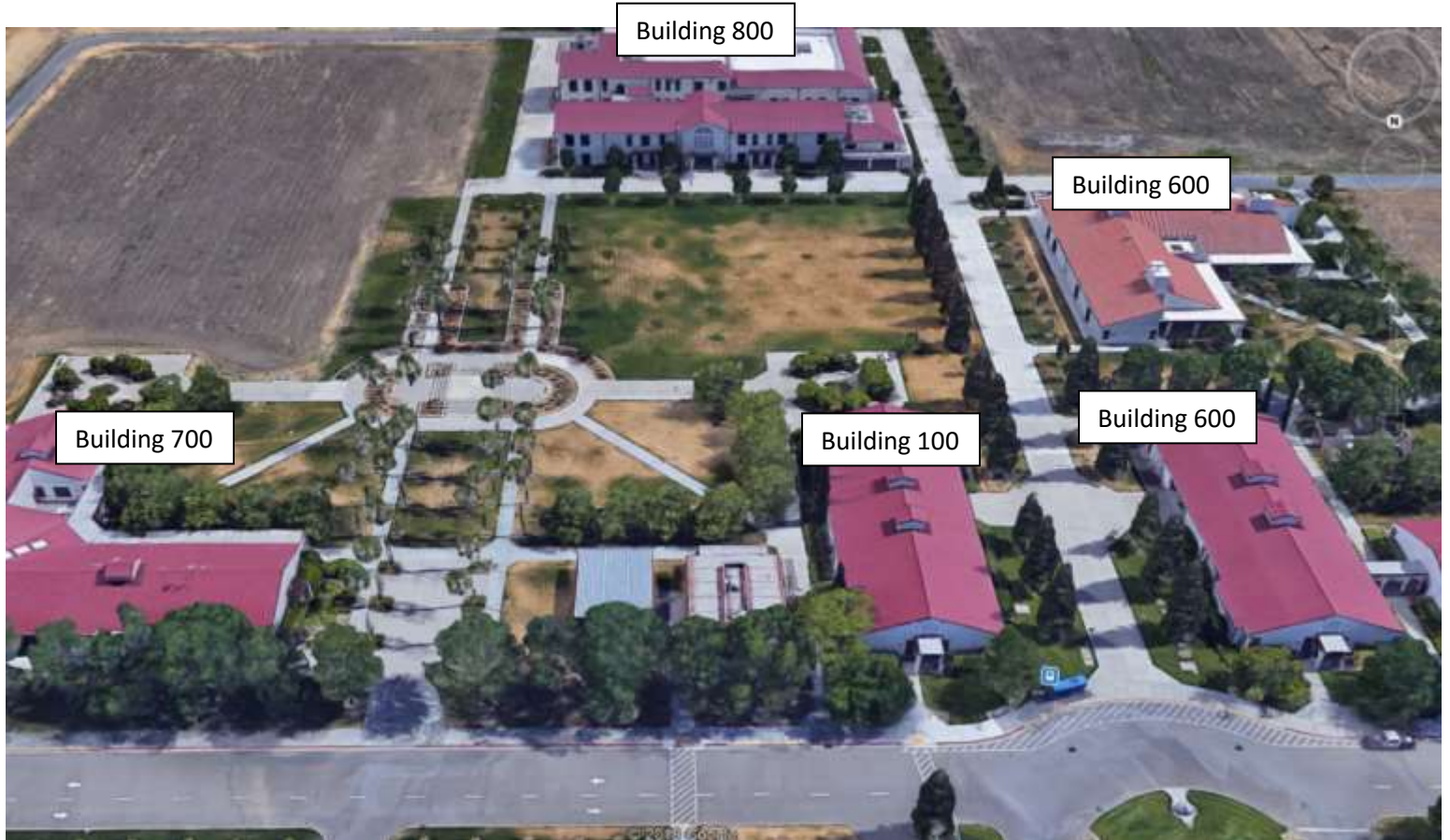
Woodland Community College Campus- Facing South

425 Plumas Blvd., Suite 200, Yuba City, California, 95991