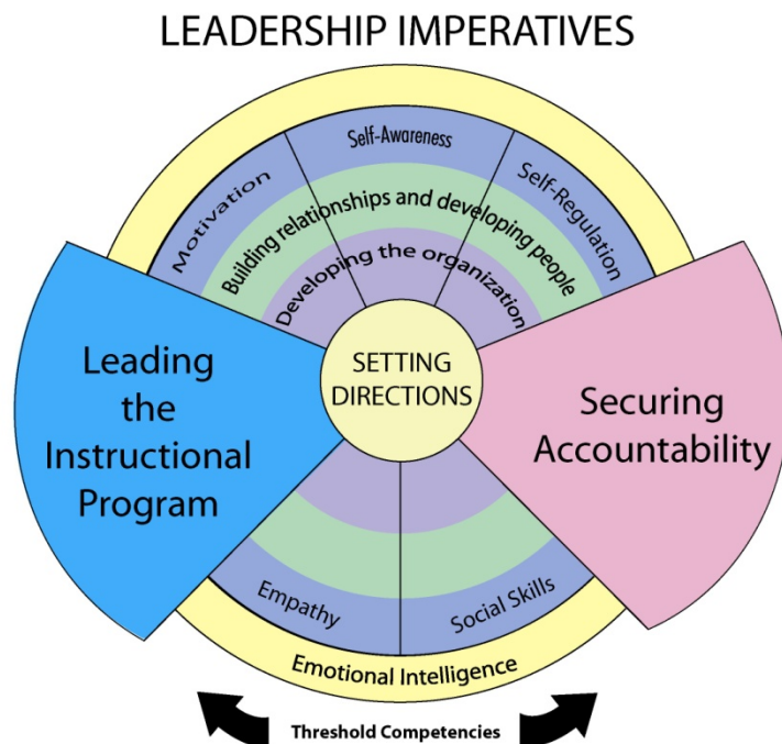
Figure 1: Leadership Practices, Competencies and Imperatives

Figure 1 illustrates a relationship between the leadership imperatives and the threshold competencies. The depiction is intended to illustrate how the outer circles must be addressed before the inner circles can be achieved. Clearly, these elements are not mutually exclusive; however, delineating each assist in better understanding what constitutes an effective school leader.