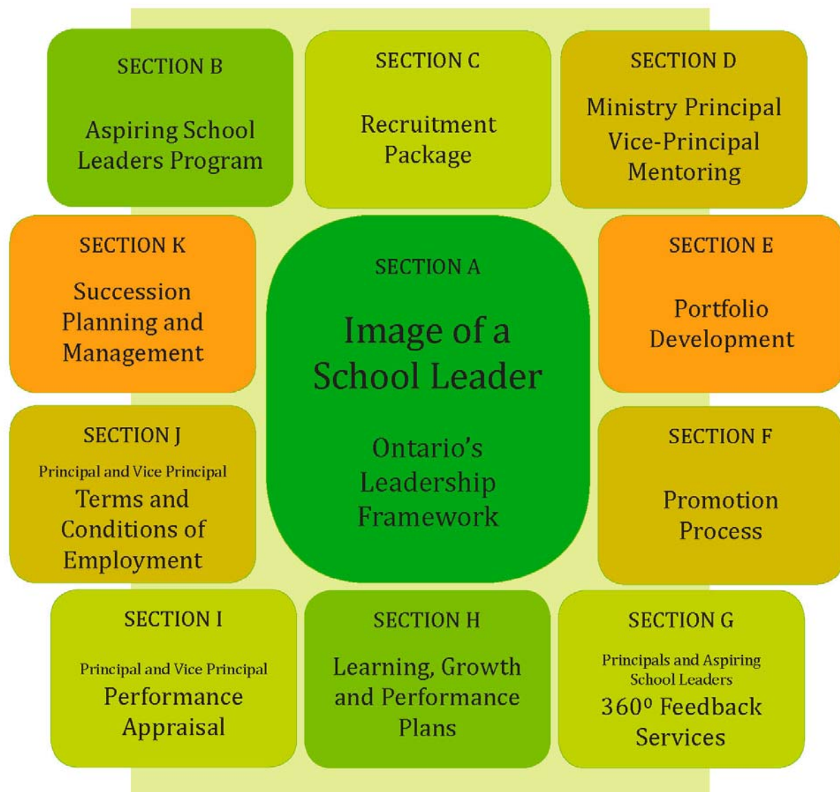
Figure 1: Elements of the School Leadership Development Plan

This resource document should be of assistance to both our aspiring school leaders and our school administrators.