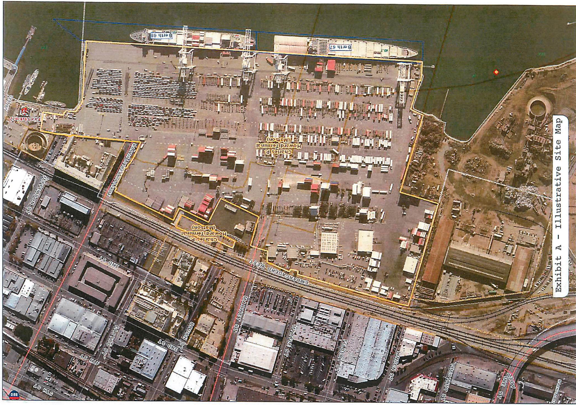
Exhibit A - Illustrative Site Map