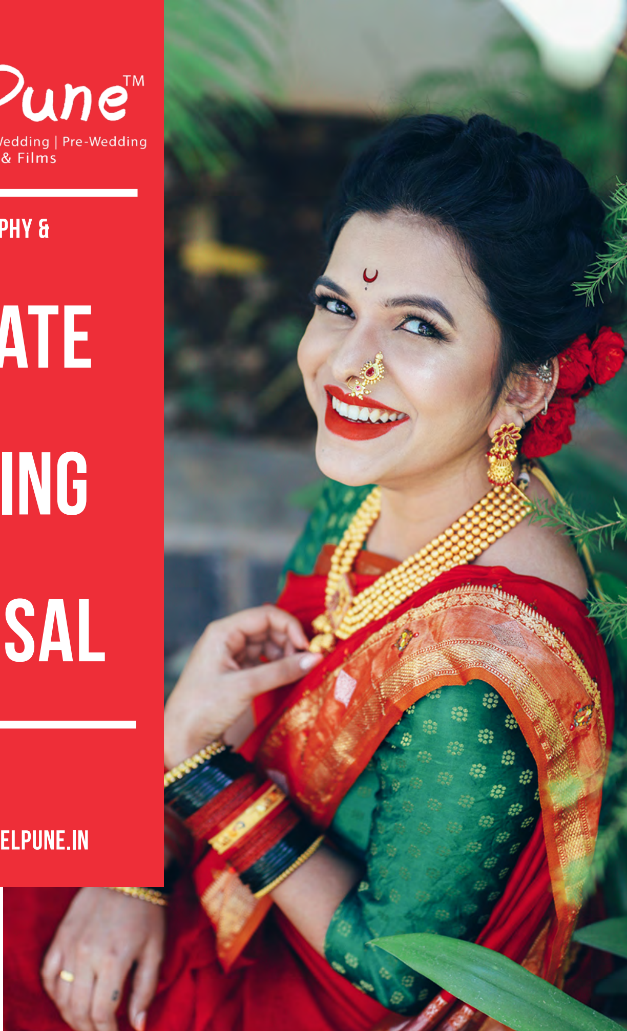
Actress Mitali Mayekar