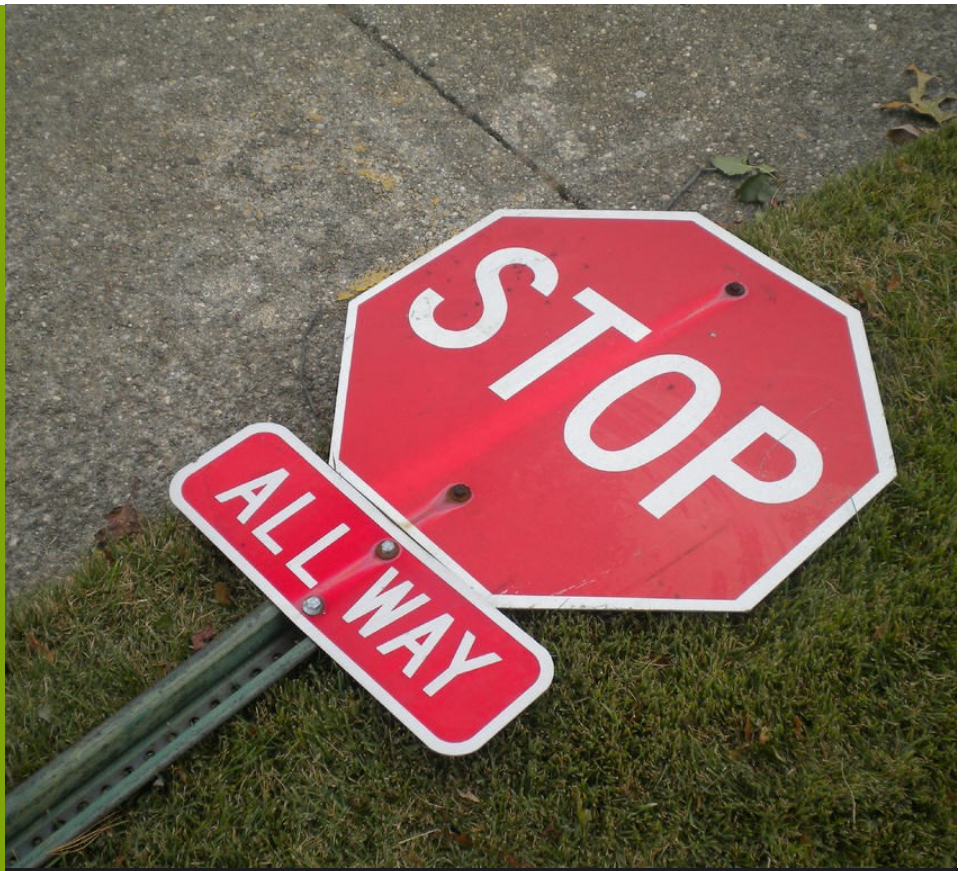
Report down stop signs