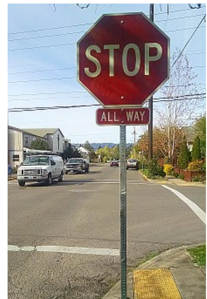
Stop sign installed

When stop signs are installed where the need to control Right-of-Way is questionable, there would be an increase in traffic delay and congestion with little or no gain in safety. In actuality, safety is sometimes reduced. Incidences of rear end collisions sometimes increase; pedestrian accidents may also increase due to a false sense of security provided by the stop sign. Excessive use of stop signs tends to frustrate motorists who may divert to less suitable streets. If motorists observe that cross street traffic is light or virtually non-existent, the value of the sign will be questioned and vehicle will roll through or ignore the sign entirely. This reduces the credibility of stop signs.