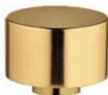
TOP PASSION CHAPÉ ALU LESTÉ OR / ARGENT / NOIR BRILLANT CACHE POMPE 15