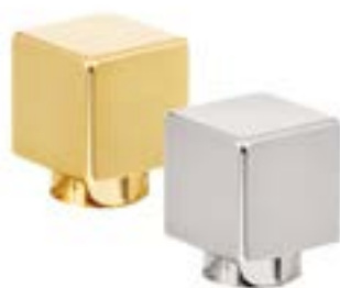
TOP CUBE CHAPÉ ALU OR / ARGENT CACHE POMPE 15