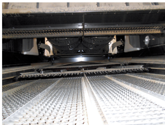
Figure 37.4 The sieve elements that collectively make up the cleaning shoe. Most common adjustments involve adjusting fan speed and sieve openings to regulate the flow of grain through the shoe and the movement of chaff to the rear.

Cleaning grain is a balance between gravity and aerodynamic forces. The grain is allowed to fall through the sieve openings into the airstream while the chaff and lighter MOG float on the airstream upward and to the rear. The oscillation of the shoe helps to move larger heavier material to the rear. A low fan speed and full sieve openings would prevent any cleaning losses, but would allow much of the chaff to pass with clean grain into the tank. A high fan speed will clean the grain, but can potentially cause some kernels to float or bounce out of the rear of the combine. Baffles in the airstream can control where the airstream passes through the sieve openings and how evenly the air is distributed along the shoe. Opening the sieves (Fig. 37.4) can allow grain to more easily fall through, even with high airspeeds. The balance of cleaning losses and foreign matter in the grain can be affected by the feed rate of material onto the shoe. It is possible to overwhelm the airflow if the flow of material onto the shoe is not even. Adjustments of individual combine designs that promote the even distribution of grain and chaff onto the shoe will reduce losses and keep the grain clean. Consult the operator's manual for the adjustments specific to your machine.