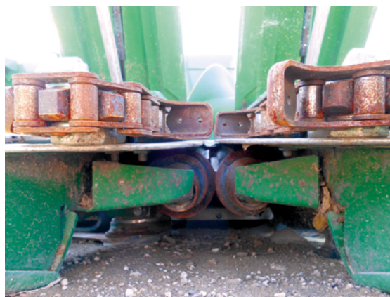
Figure 37.2 Position of snap rolls, deck plates, and gathering chains. Deck plate spacing is typically narrower where stalks enter and the gap is centered between snap rolls. Gathering chain lugs should extend about 1/4” into the deck plate gap.

Ideally deck plates should be positioned so that the space between them is centered above the space between the snap rolls underneath (Fig. 37.2). Stalks then are pulled straight down between the plates. Some heads require manual spacing of the deck plates. Others have hydraulically adjustable plate spacing. The lower spacing, where stalks enter, is recommended to be slightly narrower than the upper spacing. Many combine manuals suggest an initial spacing of 1 1/8” at the bottom and 1 1/4” at the top. With the trend to higher plant populations and smaller ears, it may be advantageous to narrow this spacing. Many producers use a pair of sockets as a handy way of spacing plates (for example, using a 1” diameter socket at the bottom and a 1 1/8” diameter socket at the top).