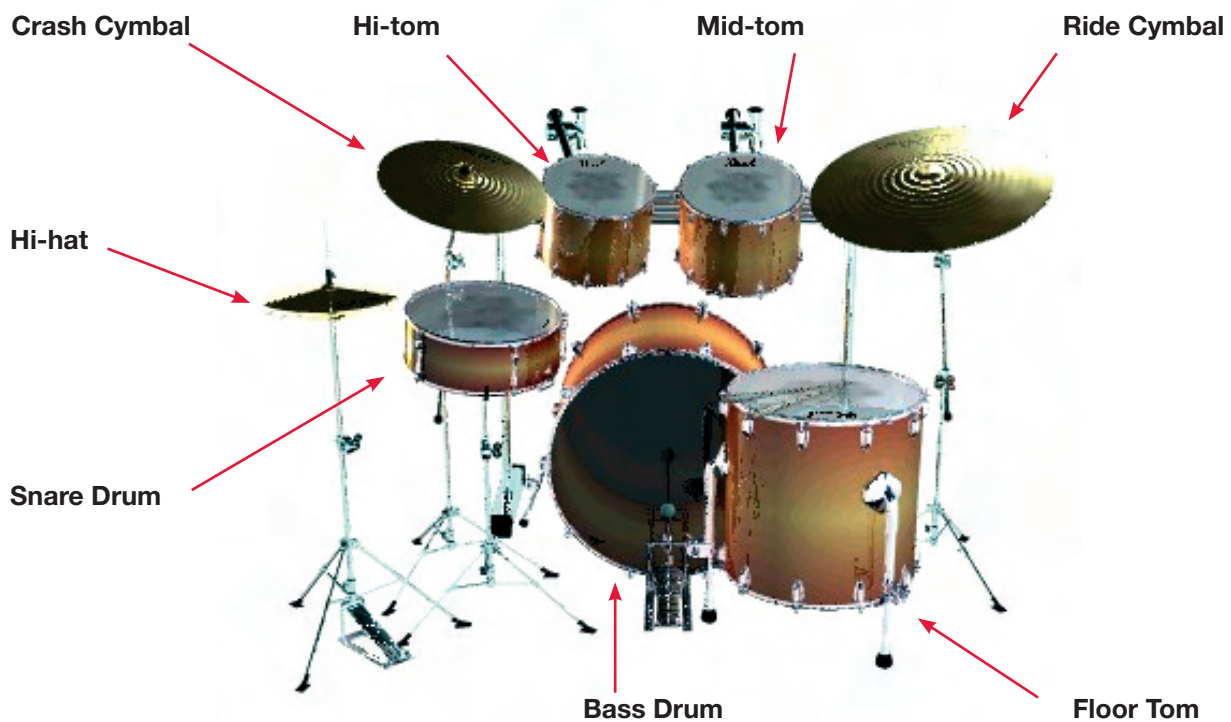
An acoustic drum kit in the standard arrangement