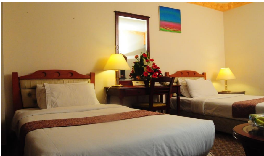
Super Deluxe Twin