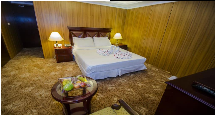
Super Deluxe Room