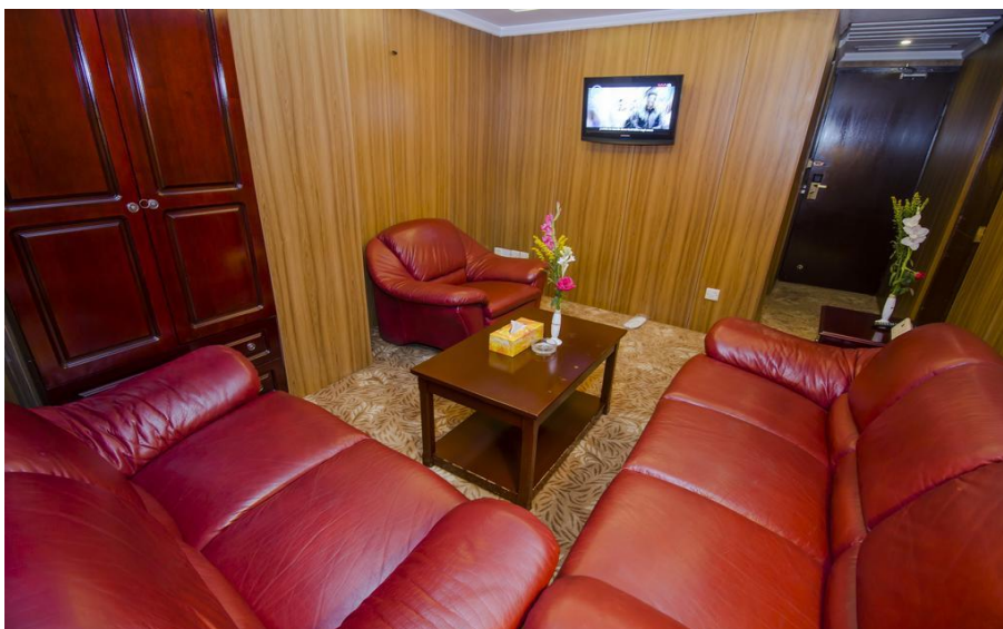
Sweet Dream Suite