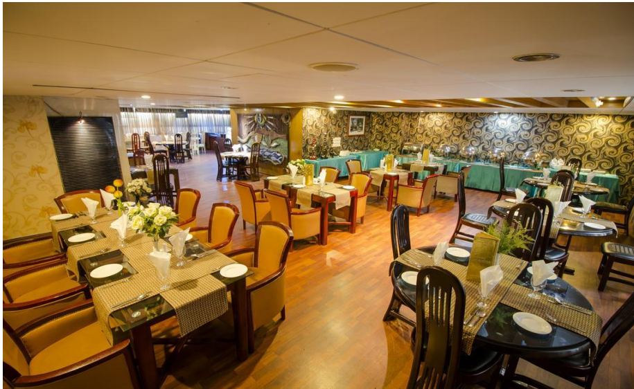
Maple Leaf Restaurant