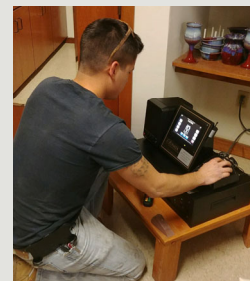
Installation of new bell system

The Stella Roman Foundation has been generous through the years and has gifted various churches with bell systems, Holy Family included. Very recently, they gifted us a new bell system to replace the circa 2001 system that we had been using. With this new technology, there are features that we will be able to utilize, along with additional songs that will play in the evenings. The speakers have not yet been updated and are not properly working. That update will come soon and you should be able to notice the sound difference a bit more. We should be blessed with the lovely sound of bells for many years to come!