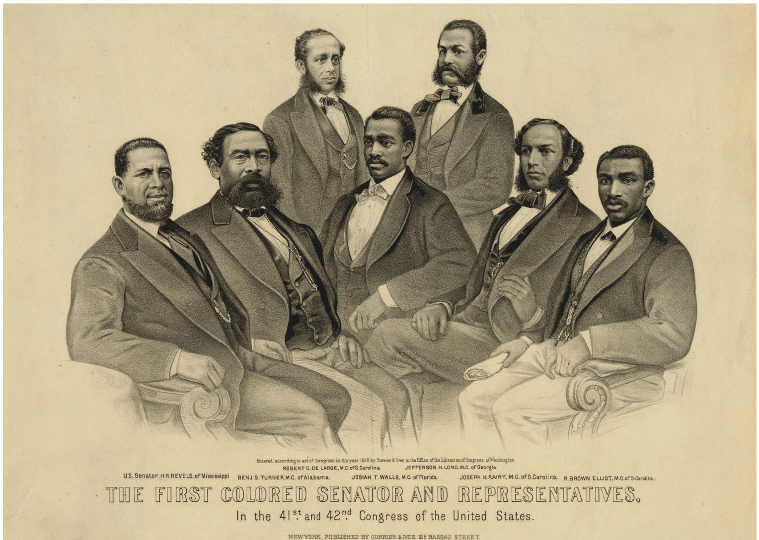
An 1872 portrait of African-Americans serving in Congress (from left): Hiram Revels, the first black man elected to the Senate; Benjamin S. Turner; Robert C. De Large; Josiah T. Walls; Jefferson H. Long; Joseph H. Rainy; and R. Brown Elliot.

story as 1776. That black Americans, as much as those men cast in alabaster in the nation's capital, are this nation's true "founding fathers." And that no people has a greater claim to that flag than us.