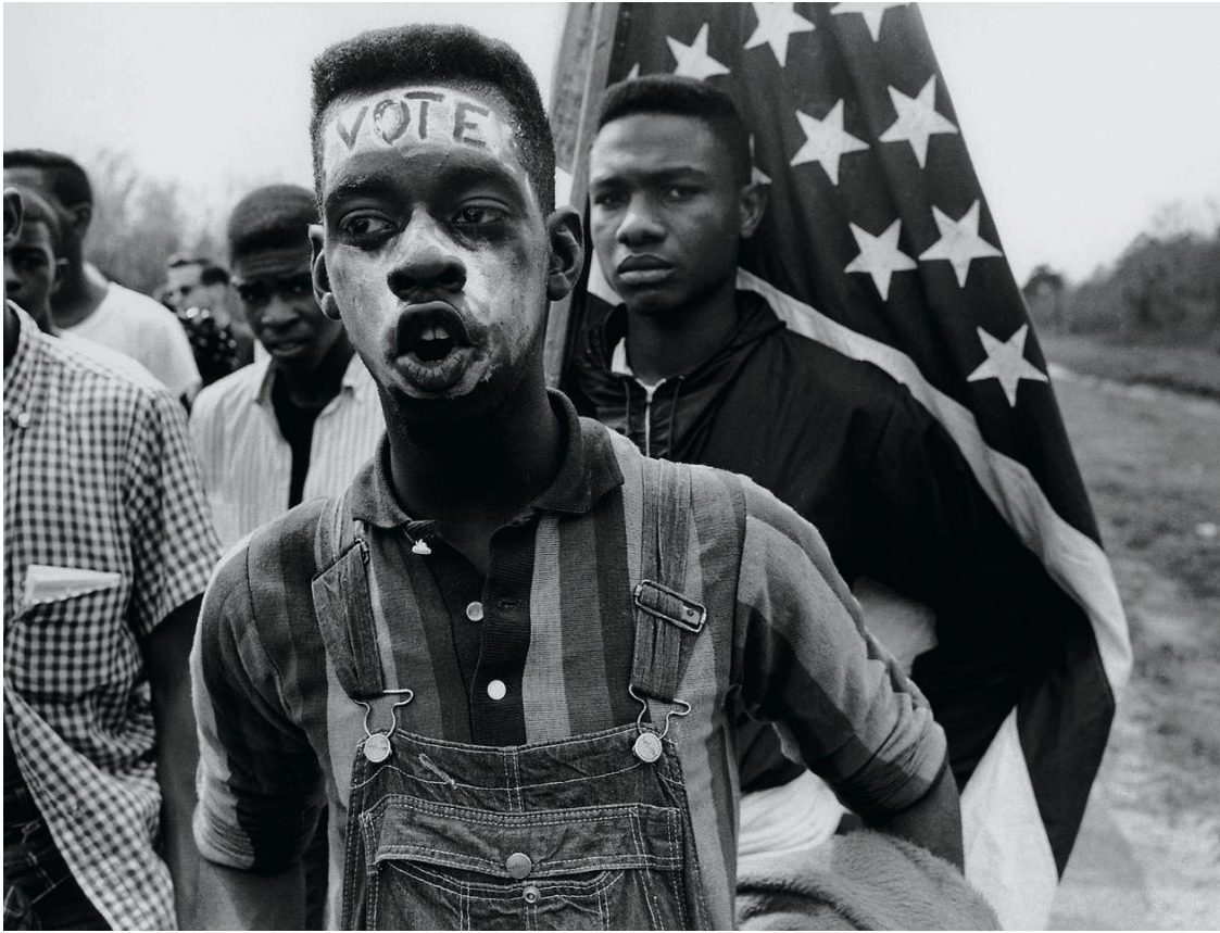
A demonstrator at the 1965 march from Selma to Montgomery, led by the Rev. Dr. Martin Luther King Jr. to fight for black suffrage.

volunteers for the war, was forced to reconsider his opposition to allowing black Americans to fight for their own liberation. The president was weighing a proclamation that threatened to emancipate all enslaved people in the states that had seceded from the Union if the states did not end the rebellion. The proclamation would also allow the formerly enslaved to join the Union army and fight against their former “masters.” But Lincoln worried about what the consequences of this radical step would be. Like many white Americans, he opposed slavery as a cruel system at odds with American ideals, but he also opposed black equality. He believed that free black people were a “troublesome presence” incompatible with a democracy intended only for white people. “Free them, and make them politically and socially our equals?” he had said four years earlier. “My own feelings will not admit of this; and if mine would, we well know that those of the great mass of white people will not.”