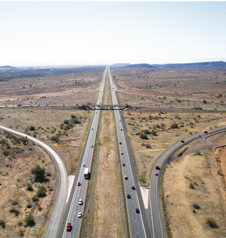
ADOT Environmental Planning