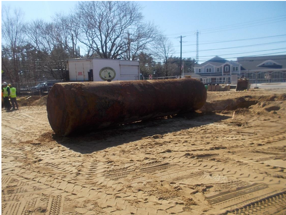
Old UST Found On Site