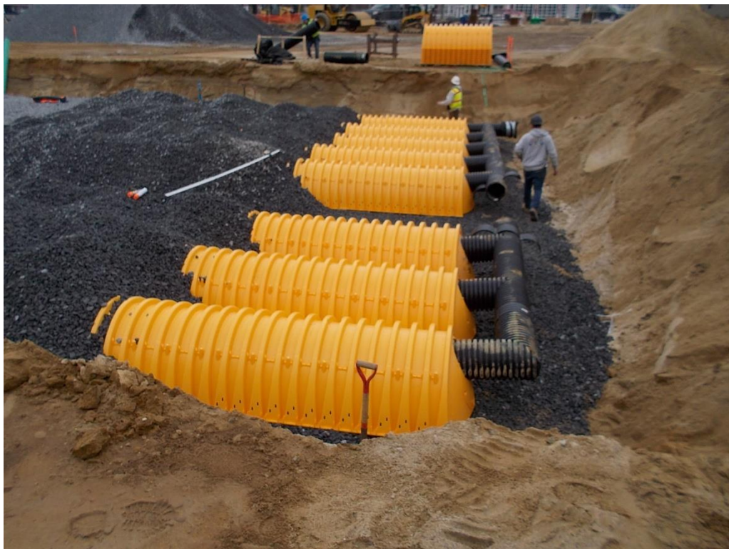
Installation and Backfill of Site Drainage Structures