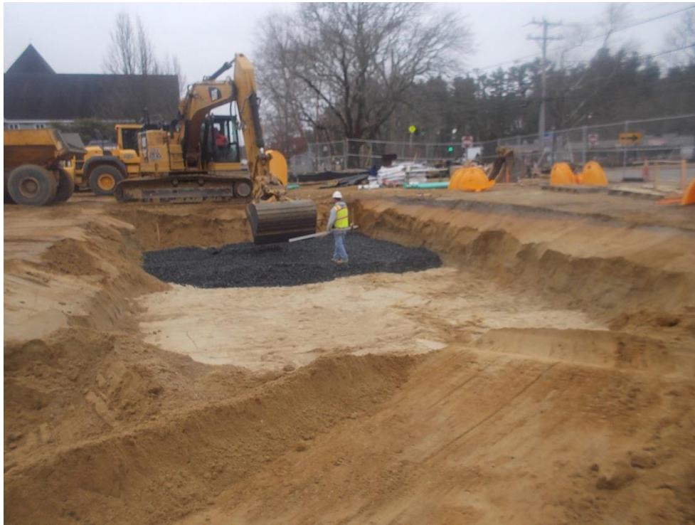
Backfilling Site Utilities