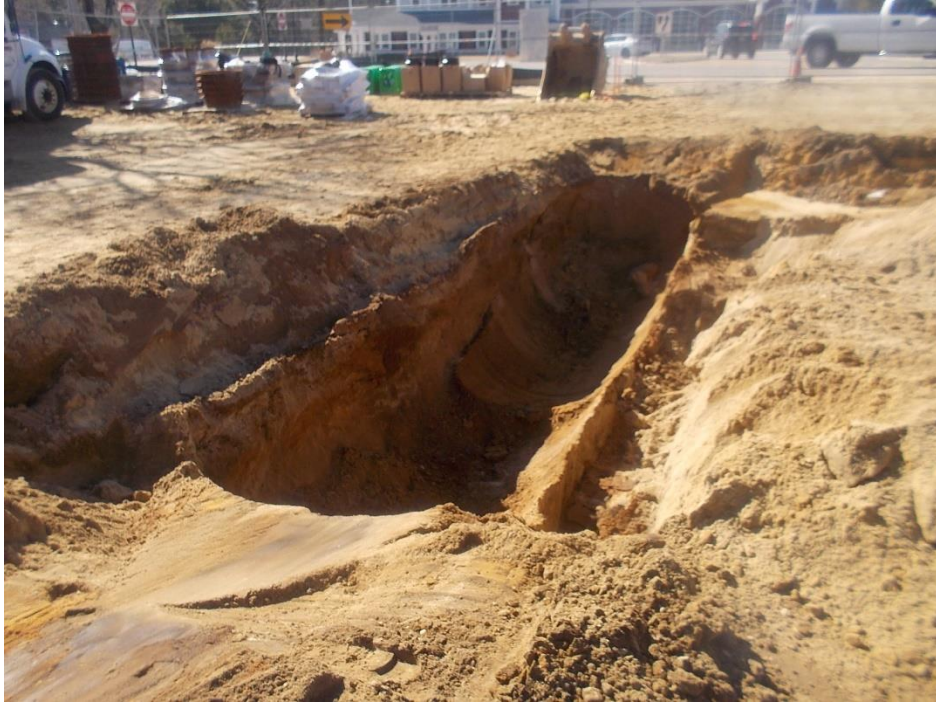
Town Dug Out Underground Tank