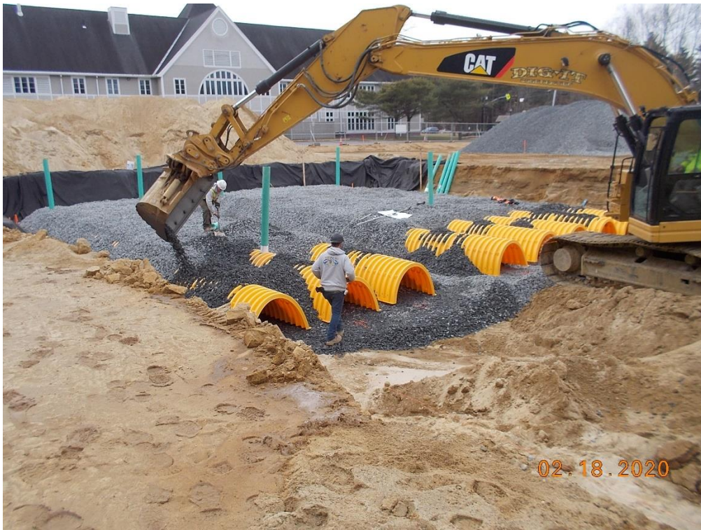
Continued Backfill of Site Drainage Structures