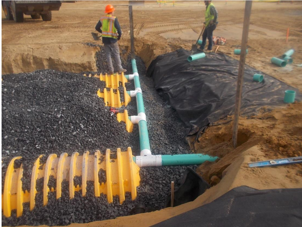
Installation and Backfill of Site Drainage Structures