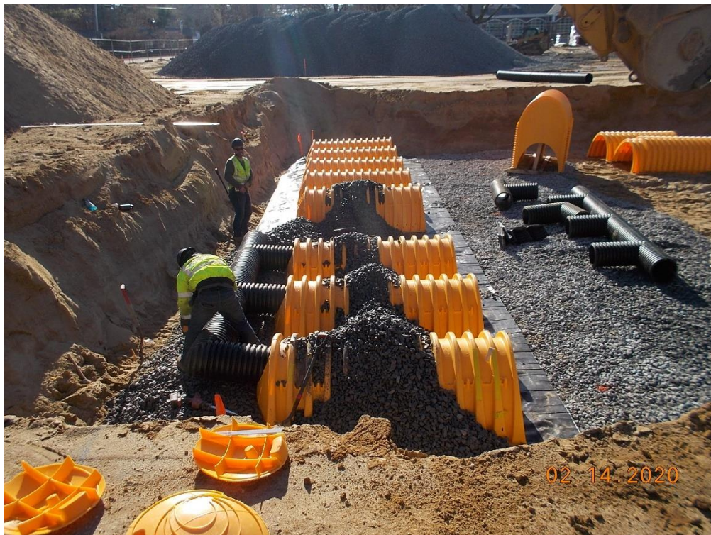
Backfilling Site Utilities