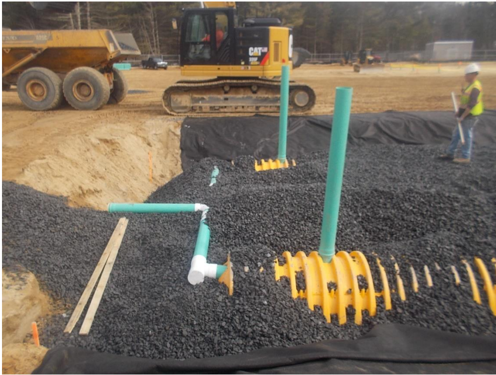
Continued Backfill of Site Drainage Structures