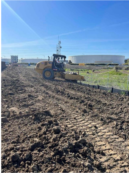
Earthen fill near AP 6 near East 3 rd Ave