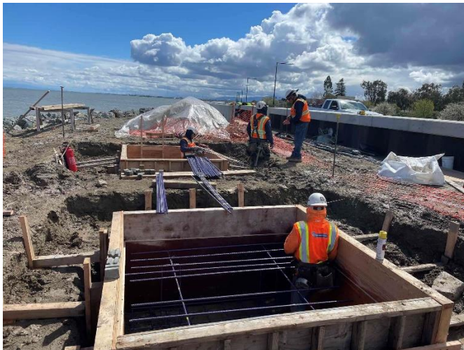
Rebar and formwork for the shade structure foundations along Beach Park Blvd near AP 17