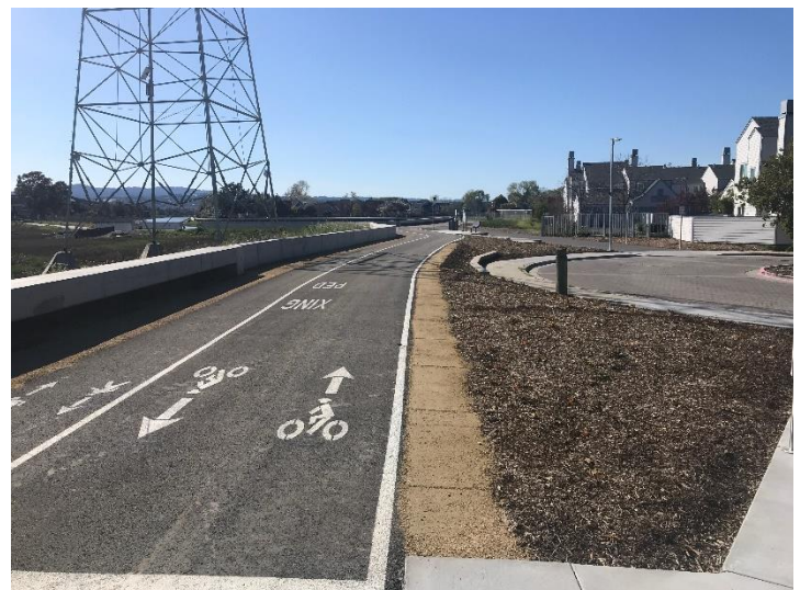
Removal of trail closure fencing near AP 38 Baffin Court