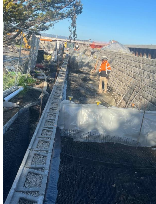
AP 10 retaining wall construction near the San Mateo Bridge